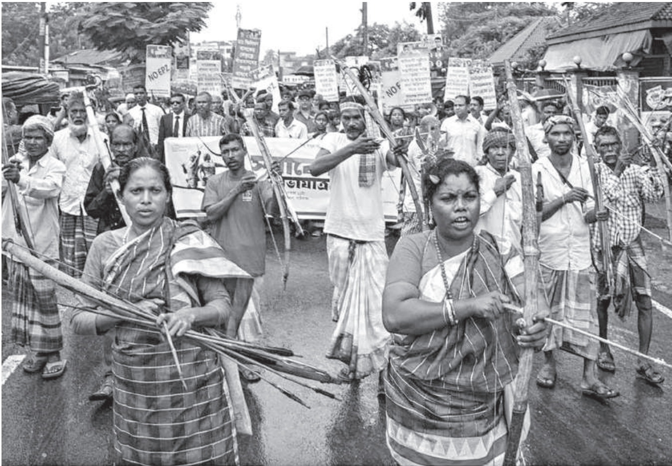
Santal community yesterday observed the 169th anniversary of their historic rebellion, commonly known as Santal Hool, in Gaibandha. Marking the occasion, they brought out a procession in the afternoon. According to historians, Santals in Jharkhanda revolted on June 30, 1855 against the misrule, torture and extortion by zamindars, wholesalers and police. The revolution lasted eight months and thousands of Santals and others were killed.