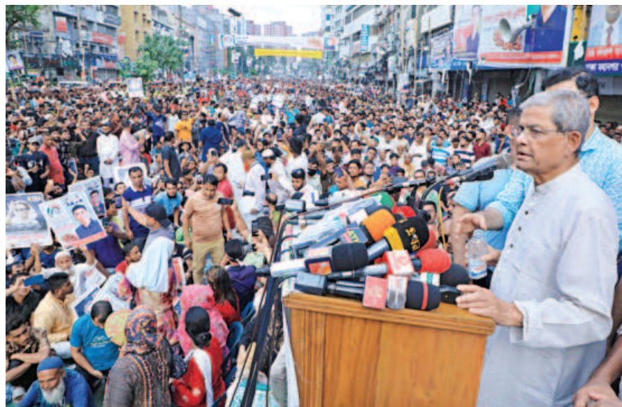
Left, Awami League General Secretary Obaidul Quader addresses an event in front of the party headquarters in Gulistan yesterday afternoon, marking its 75th founding anniversary. Right, demanding immediate, unconditional release of party Chairperson Khaleda Zia, BNP Secretary General Mirza Fakhrul Islam Alamgir speaks at a rally in front of its central office in the city's Nayapaltn area around the same time.