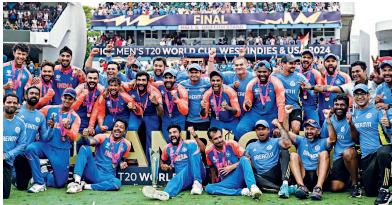
India players and officials celebrate with the trophy after winning the ICC Men's Twenty20 World Cup following a thrilling seven-run victory in the final at Kensington Oval in Bridgetown yesterday.

BLACK MONEY HOLDERS GET AMNESTY - PAGE 12