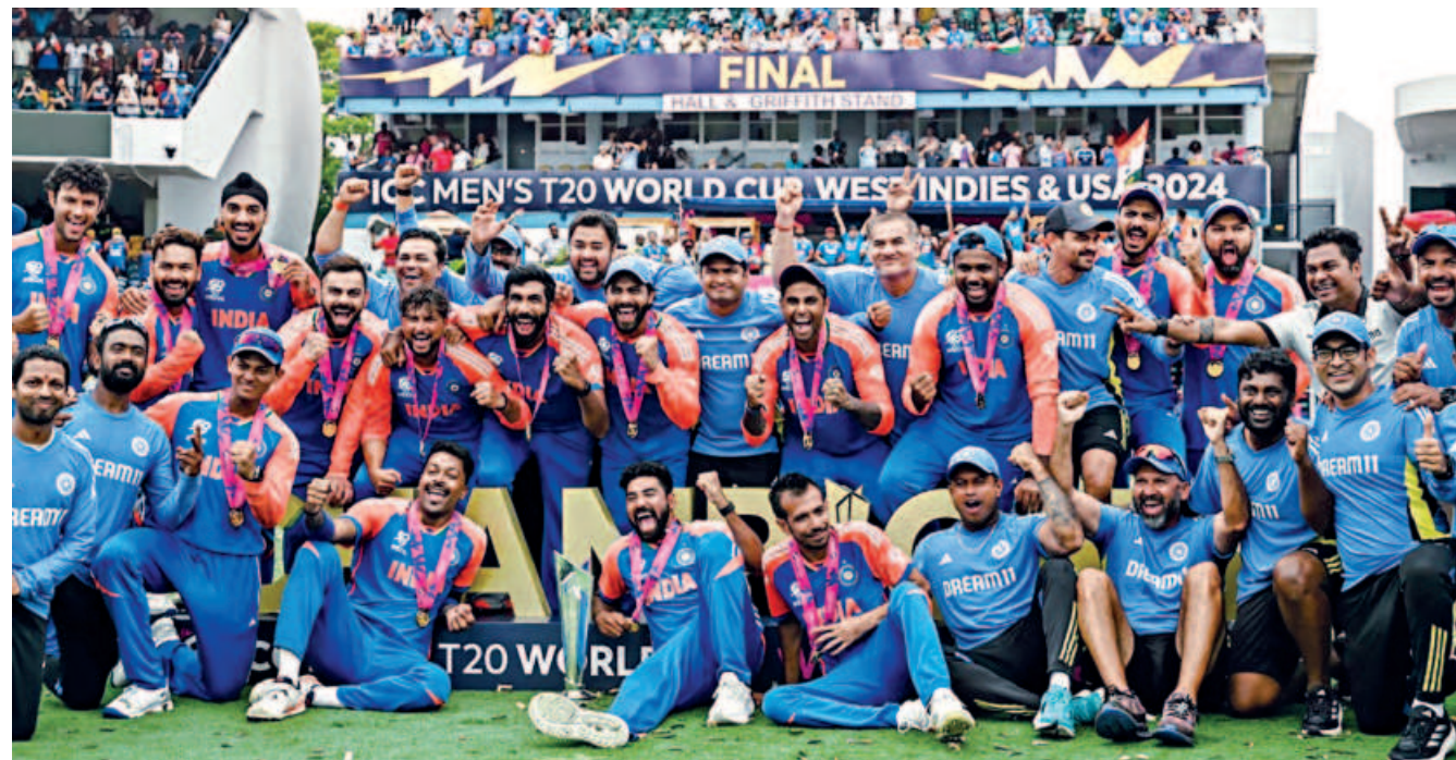
India players and officials celebrate with the trophy after winning the ICC Men's Twenty20 World Cup following a thrilling seven-run victory against South Africa in the final at Kensington Oval in Bridgetown yesterday.

BLACK MONEY HOLDERS GET AMNESTY - PAGE 12