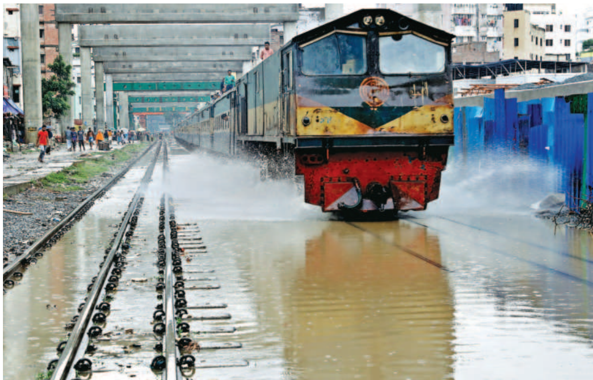
A train runs on the flooded lines in the capital's Malibagh following heavy rain yesterday morning. Locals say this area started experiencing waterlogging after the construction work of the Dhaka Elevated Expressway commenced.