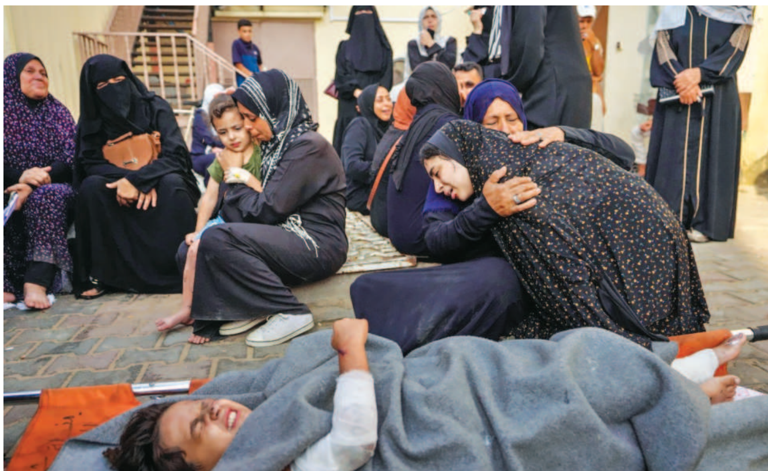
An injured girl reacts while lying on a stretcher on the ground as women mourn the death of their relatives at the Aqsa Martyrs Hospital in Deir el-Balah yesterday, following Israeli bombardments in the central Gaza Strip.