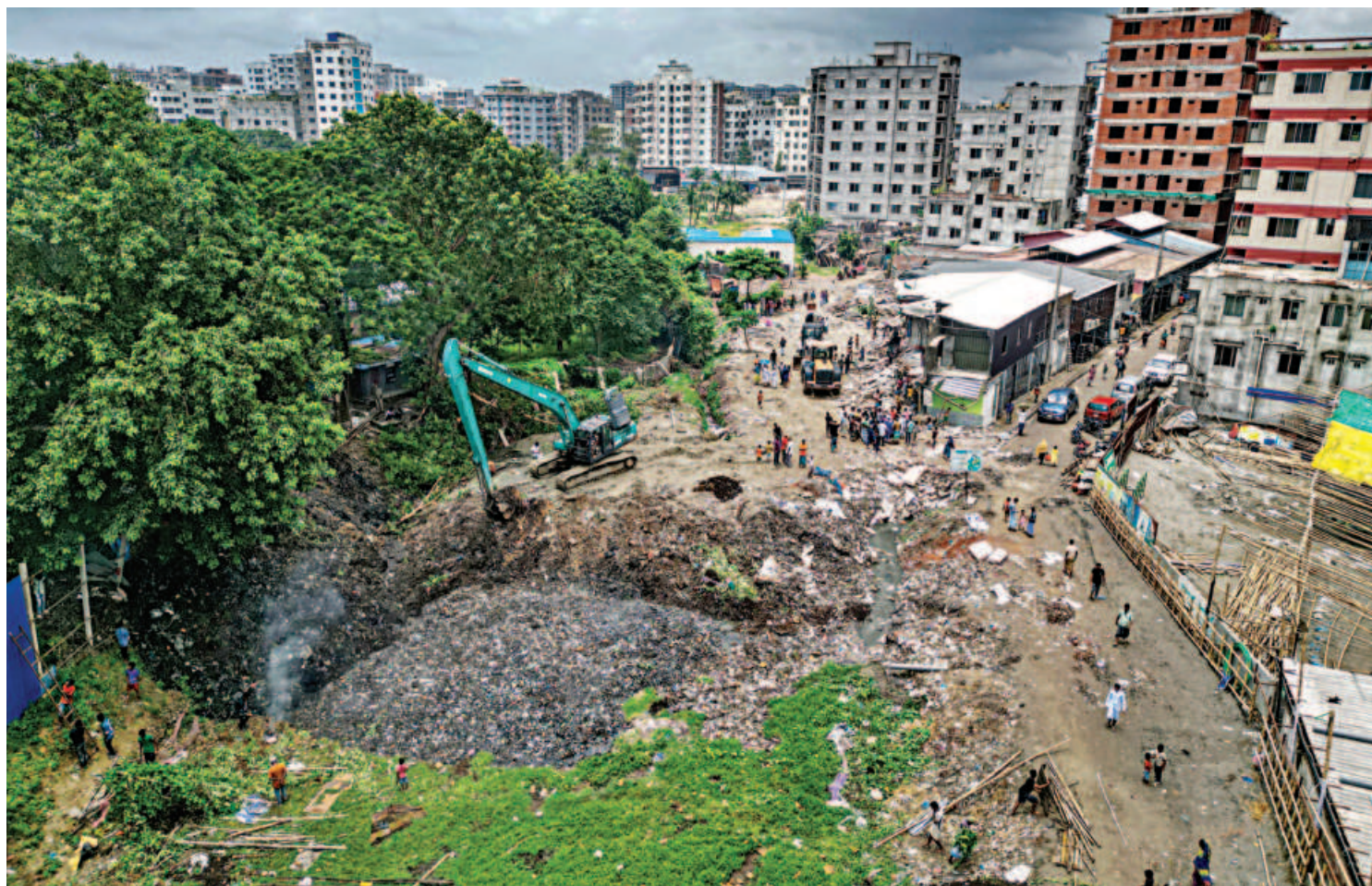
An excavator of the Dhaka North City Corporation removing waste from the Ramchandrapur canal in the capital's Mohammadpur yesterday. The move came a day after the corporation knocked down illegal structures of Sadeeq Agro for encroaching on the canal.