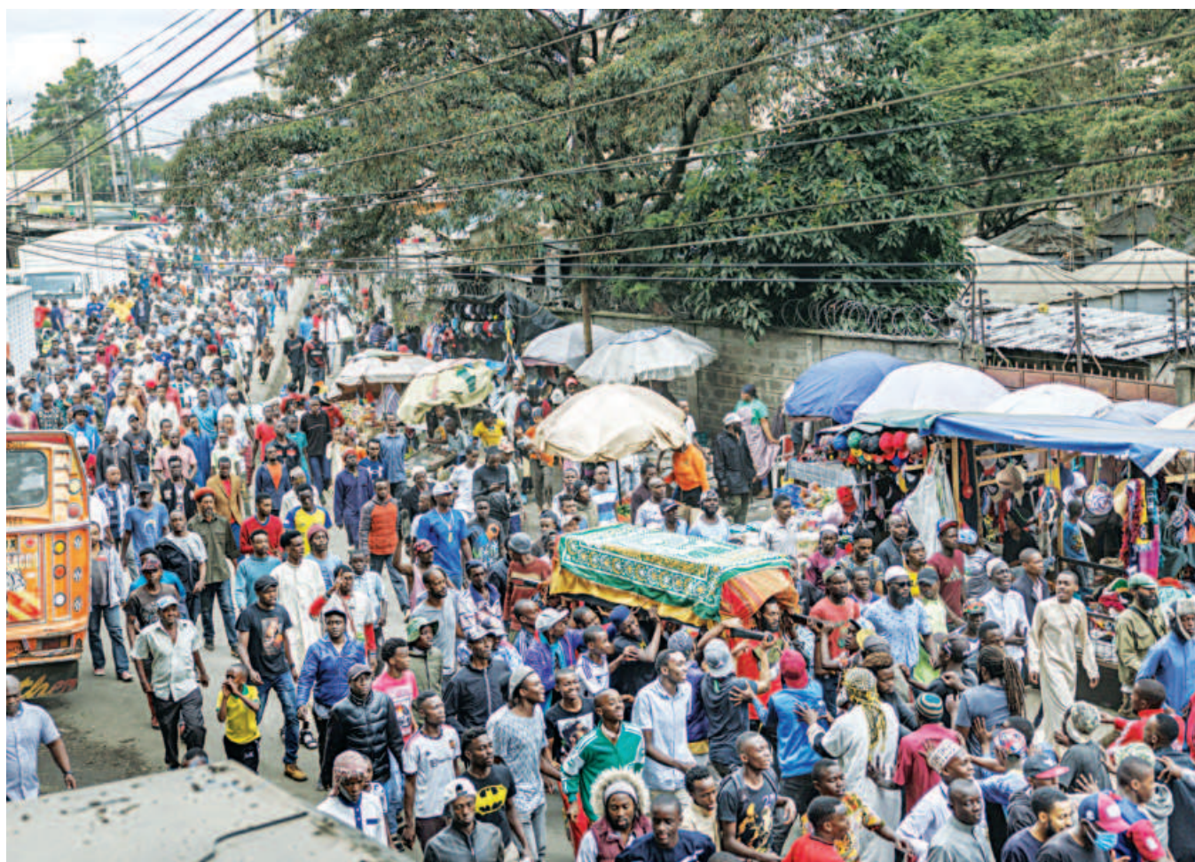
People carry the body of a protester in a procession in Nairobi yesterday. Hundreds of people attended the funeral ceremony of the 19-year-old who was one of 20 people killed during a nationwide protest against a controversial now-withdrawn tax bill.

MSF was suspending "medical humanitarian activities" in northern Rakhine due to the "extreme escalation of conflict, indiscriminate violence, and severe restrictions on humanitarian access," it said on Thursday.