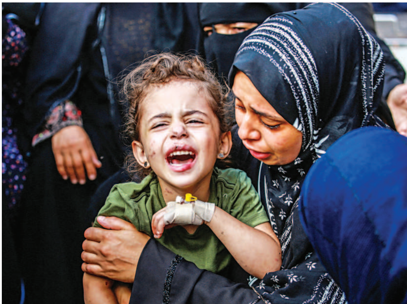
An injured girl is comforted by her relatives at the Al-Aqsa Martyrs Hospital in Deir el-Balah yesterday, following Israeli bombardments in the central Gaza Strip.

Dozens of lawsuits aimed at overturning the election failed, while audits and recounts in battleground states reaffirmed Biden's win.