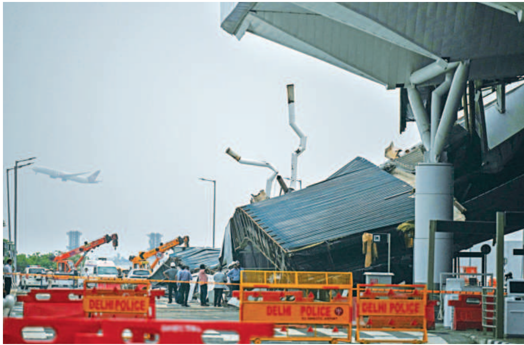
Rescuers work at the collapsed terminal roof of New Delhi's international airport after heavy rains in New Delhi yesterday.

It was announced on Thursday that the Third Plenum -- a meeting historically watched for signals on economic policy direction -- will take place in Beijing in mid-July.