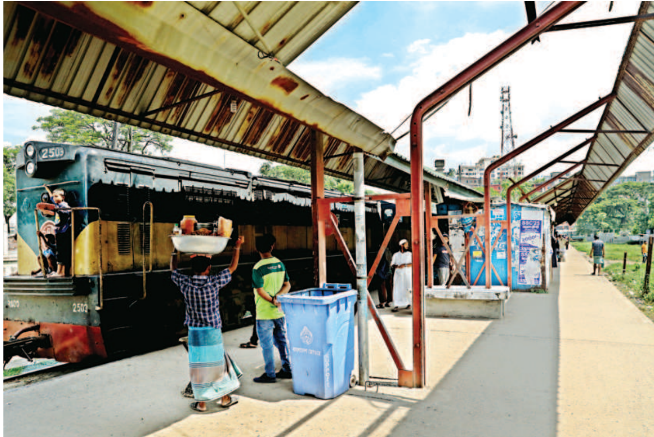
The roof of the platform at Narayanganj's Fatullah Railway Station is falling apart due to a lack of maintenance. This is causing suffering to passengers as they find it difficult to cover themselves from sun and rain. The photo was taken on Thursday.