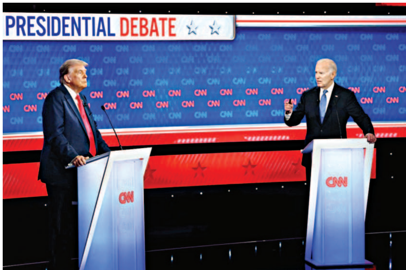
Democrat candidate, US President Joe Biden, and Republican candidate, former US president Donald Trump, attend a debate ahead of the US presidential election, in Atlanta, Georgia, US, on Thursday.