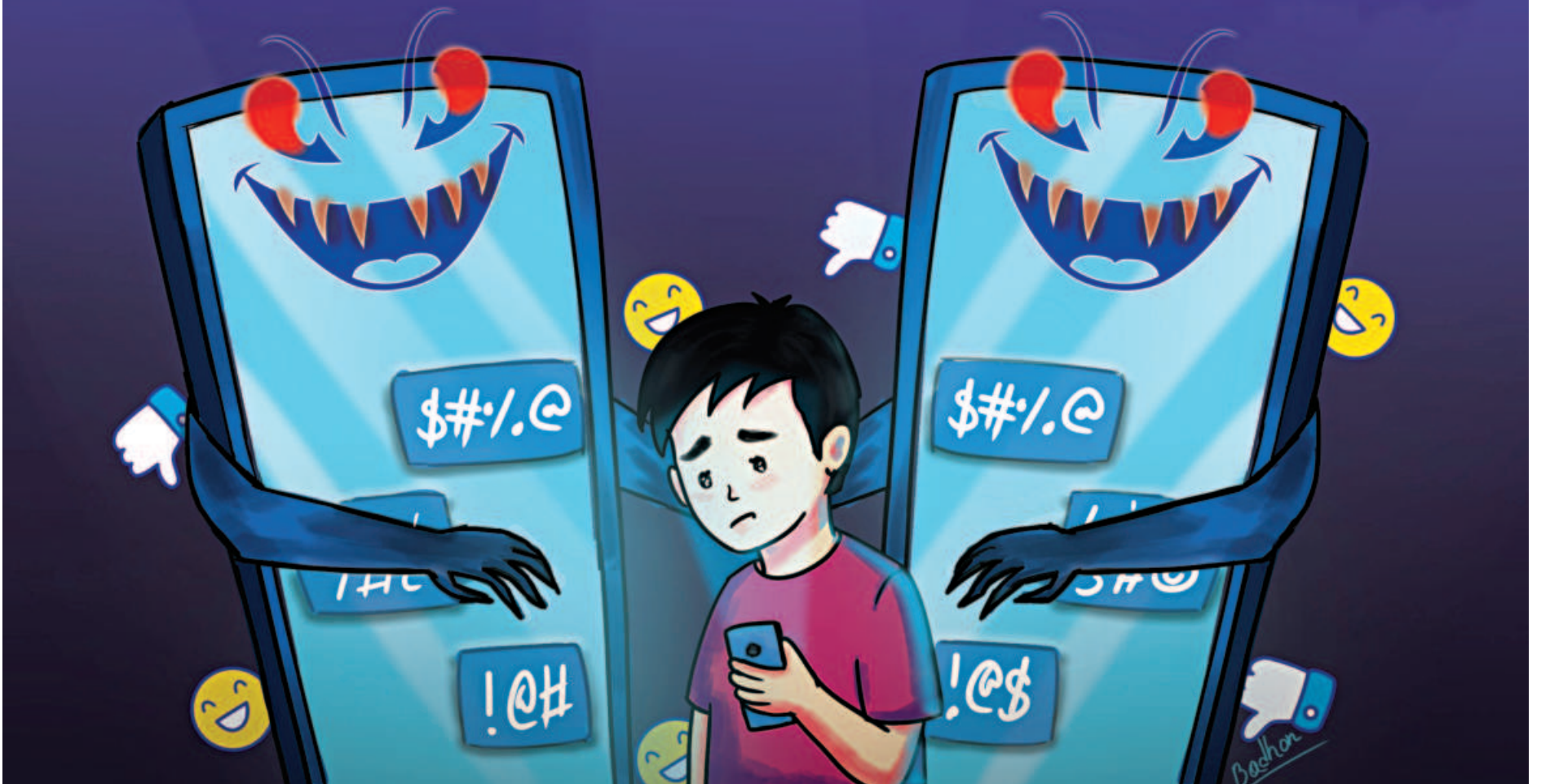
ILLUSTRATION: SHAIKH SULTANA JAHAN BADHON