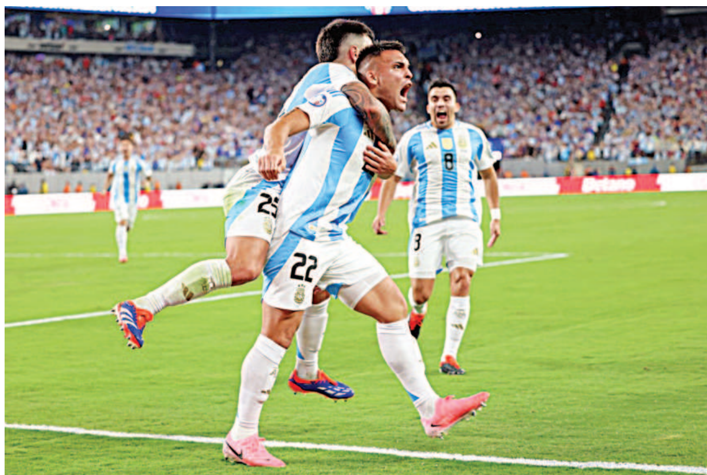
Argentina striker Lautaro Martinez celebrates with Lisandro Martinez and Marcos Acuna following his last-gasp winner against Chile in Copa Group A match at MetLife Stadium in East Rutherford, New Jersey yesterday. The Inter Milan striker came off the bench to score the decisive goal as the defending champions cruised into the quarterfinals of the 16-team competition.