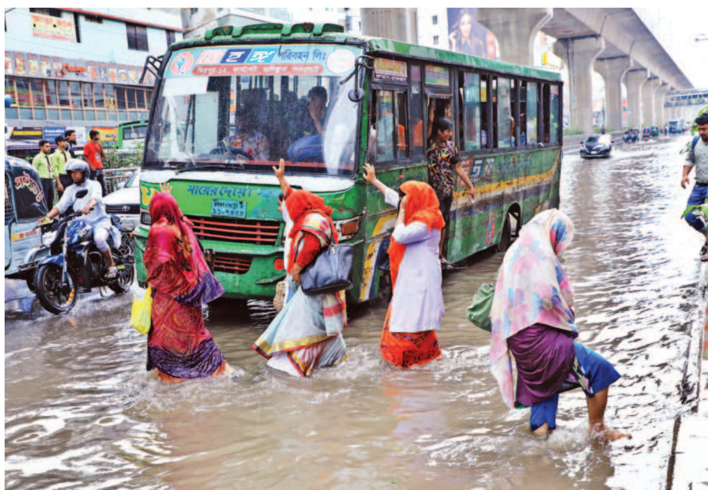
Women walking across Begum Rokeya Sarani after an hour of downpour flooded parts of the street yesterday morning. Many other areas in the capital often remain waterlogged in monsoon due to poor drainage.