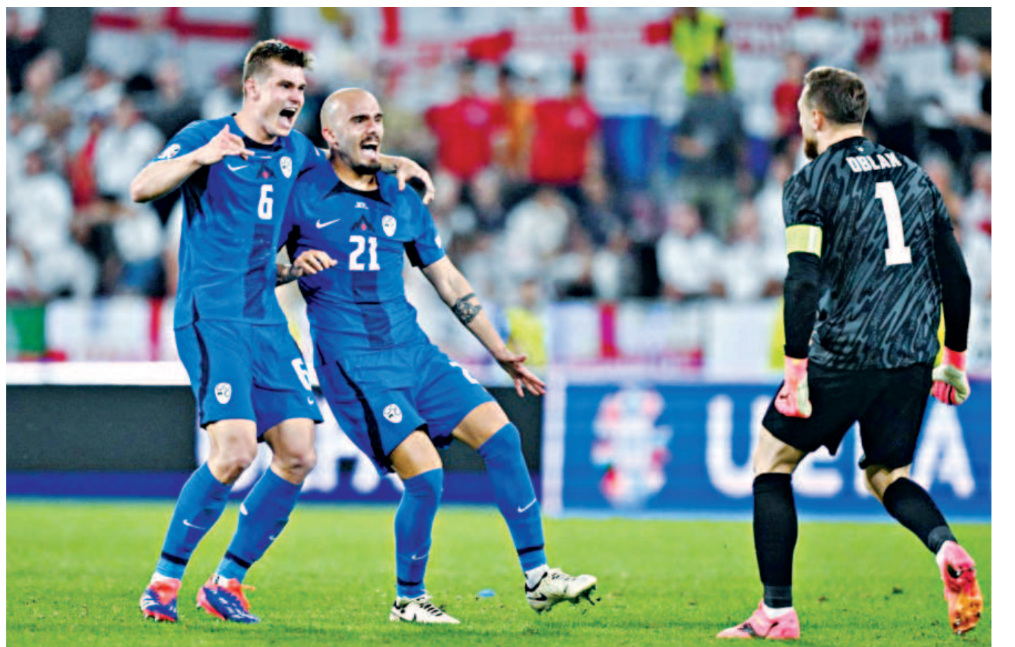
Slovenia's Jaka Bijol and Vanja Drkusic celebrate with goalkeeper Jan Oblak after qualifying for the Round of 16 of Euro 2024 following a goalless draw against England in their last Group C match at Cologne Stadium on Tuesday. The Central European nation drew all three of their matches and qualified for the knockout rounds for the first time in their history in only their second appearance in the continental competition.