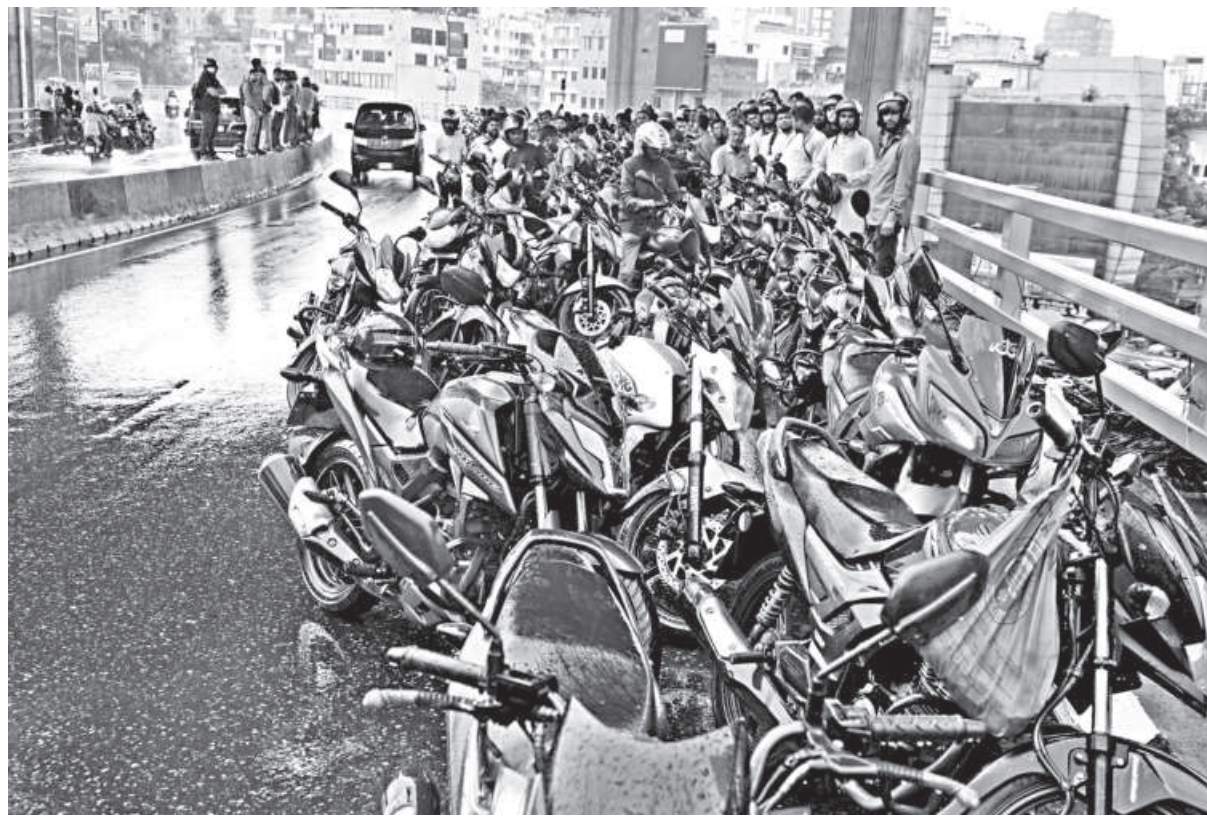
Sudden rain in the capital yesterday forced these bikers to stop at a section of the Mohakhali flyover. Doing this, they also took up a portion of the flyover, leaving only one lane for other vehicles to use.