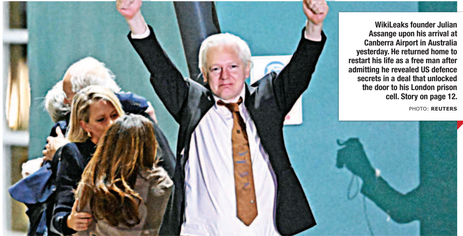
WikiLeaks founder Julian Assange upon his arrival at Canberra Airport in Australia yesterday. He returned home to restart his life as a free man after admitting he revealed US defence secrets in a deal that unlocked the door to his London prison cell. Story on page 12.