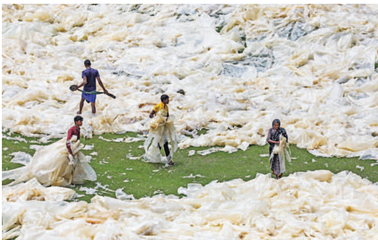
Workers cleaning and drying plastic sheets under the sun in Razanagar area of Rangunia, Chattogram city, before sending these to facilities in Dhaka for recycling. The sheets used by brick kilns to protect clay from rains in monsoon become unusable due to wear and tear after a season. Recycling keeps these from adding to the plastic waste. The photo was taken yesterday.