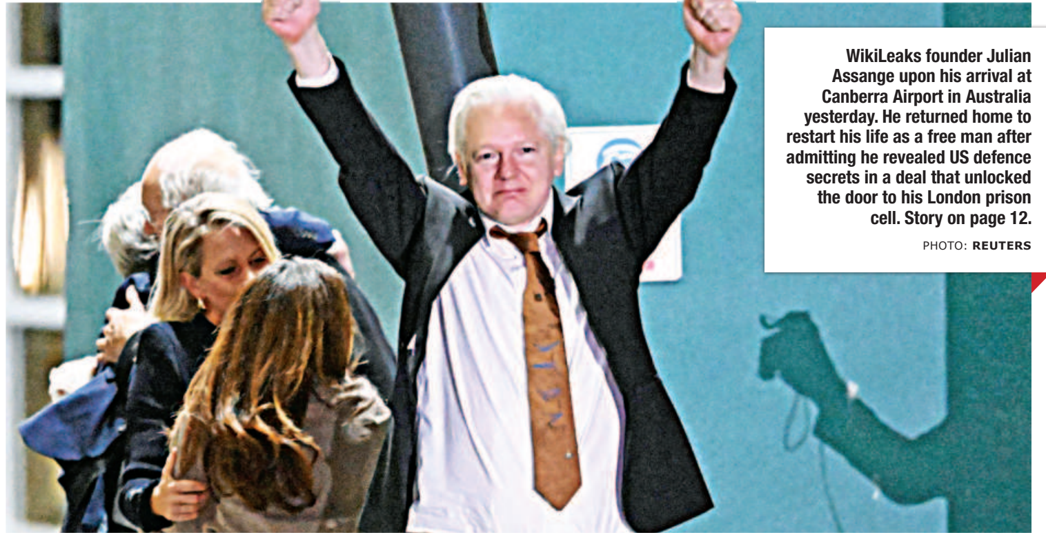
WikiLeaks founder Julian Assange upon his arrival at Canberra Airport in Australia yesterday. He returned home to restart his life as a free man after admitting he revealed US defence secrets in a deal that unlocked the door to his London prison cell. Story on page 12.