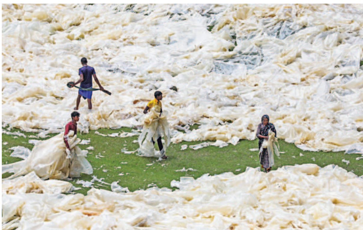
Workers cleaning and drying plastic sheets under the sun in Razanagar area of Rangunia, Chattogram city, before sending these to facilities in Dhaka for recycling. The sheets used by brick kilns to protect clay from rains in monsoon become unusable due to wear and tear after a season. Recycling keeps these from adding to the plastic waste. The photo was taken yesterday.