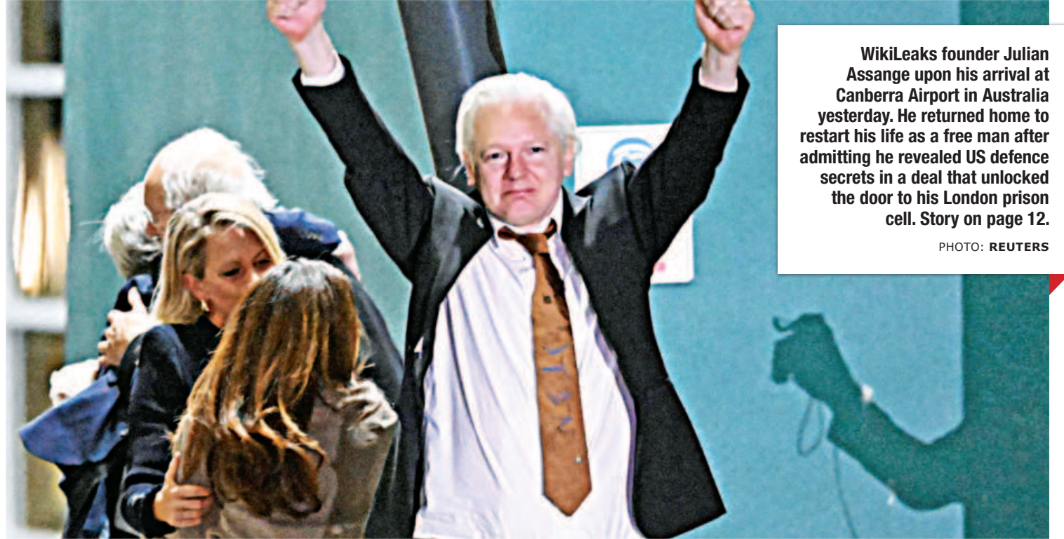
WikiLeaks founder Julian Assange upon his arrival at Canberra Airport in Australia yesterday. He returned home to restart his life as a free man after admitting he revealed US defence secrets in a deal that unlocked the door to his London prison cell. Story on page 12.