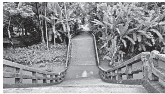
Out of 12 bridges in different areas on the 25-kilometre-long Haldia canal, seven have already collapsed while the rest five are in a dilapidated condition. On June 22, the bridge adjacent to Haldia Bazar collapsed, leaving at least nine people dead.