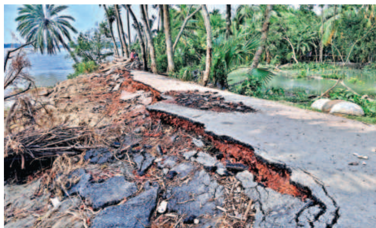
A damaged road in Bagerhat after cyclone Remal.

According to RHD data, 25 roads under Sylhet, Sunamganj,