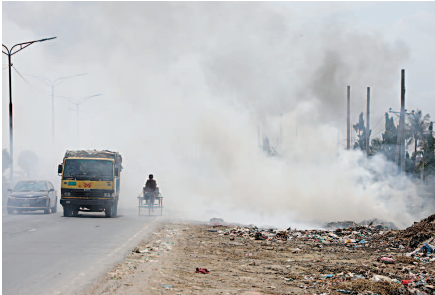
A pile of illegally dumped waste was set on fire in the Boliarpur area on the Dhaka-Savar highway, polluting the surrounding air. The smoke is also a hindrance to passing vehicles, as it reduces visibility on the road and could even result in an accident. The photo was taken recently.

For details visit www.pubalibangla.com or contact nearest branch, sub-branch or Islamic banking window | No charges in Transactions