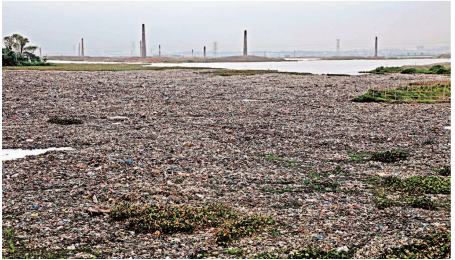
Waste dumped in the capital's Aminbazaar landfill is flowing into the nearby waterbody, potentially threatening the health of the surface water. In the absence of proper management and segregation of the waste, which is needed for its decomposition, areas surrounding the landfill are becoming polluted. The photo was taken recently.