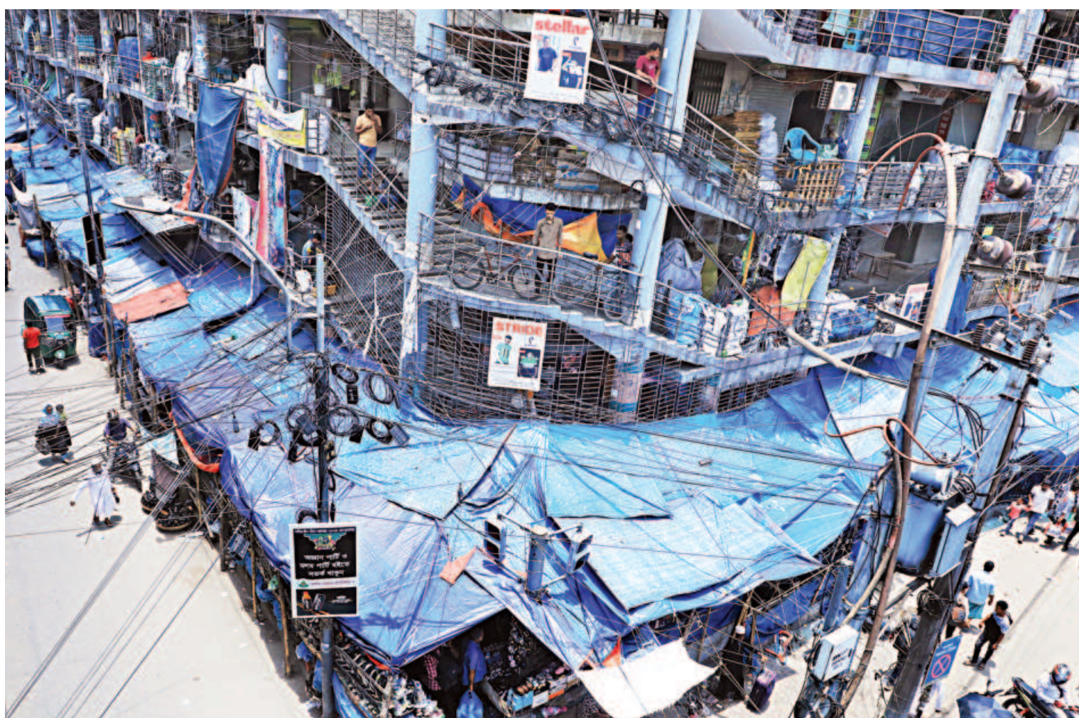
Traders set up makeshift shops occupying the footpath next to a multi-storey shopping mall in the capital's Gulistan, forcing pedestrians to walk on the street. The photo was taken around noon yesterday.