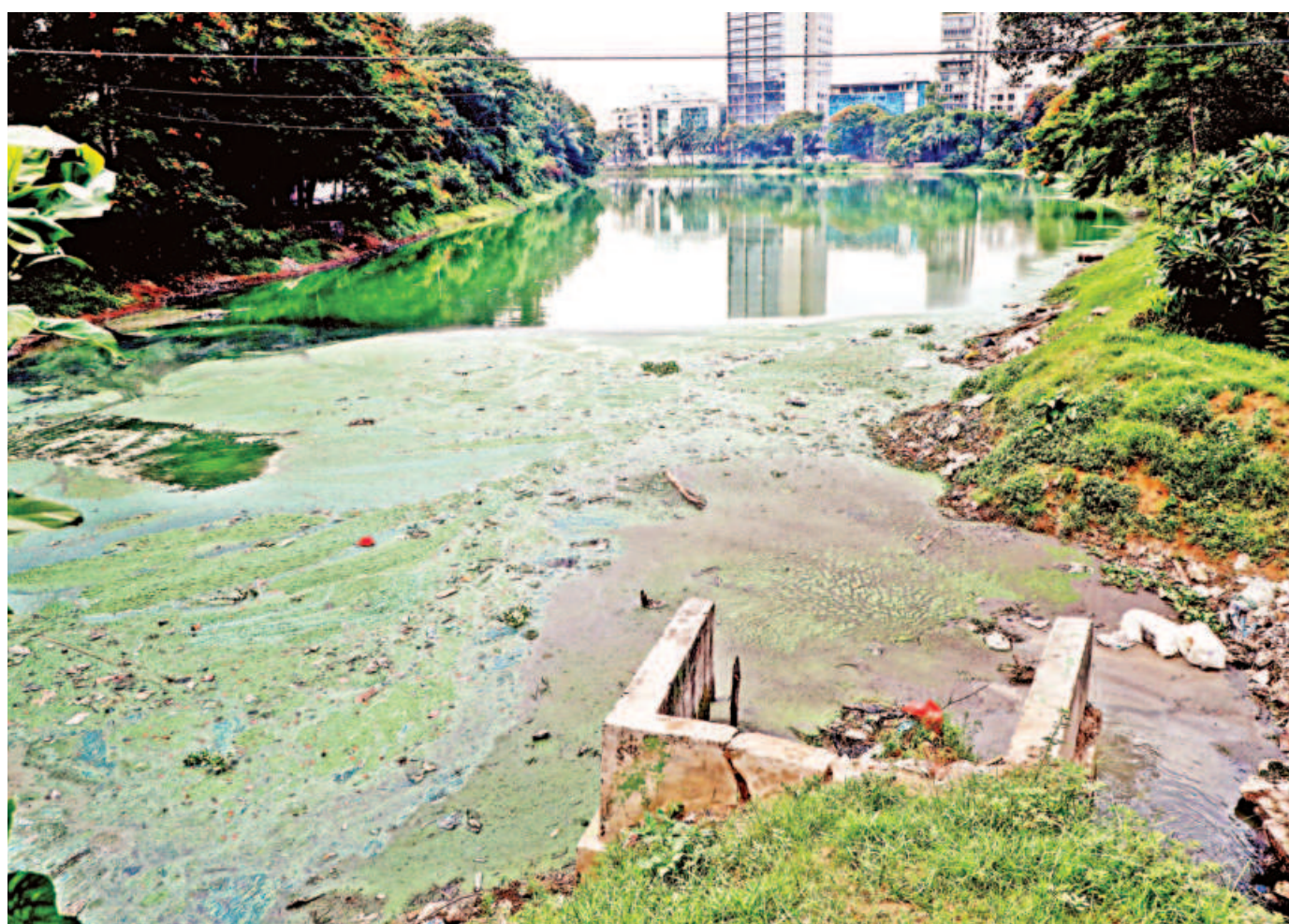
The water of the Gulshan-Banani-Baridhara lake wears a slimy, green look due to extensive pollution from household waste. The stench from the lake has become so unbearable that people have to cover their noses from far away to avoid it. The photo was taken from the capital's Kemal Ataturk Avenue yesterday.