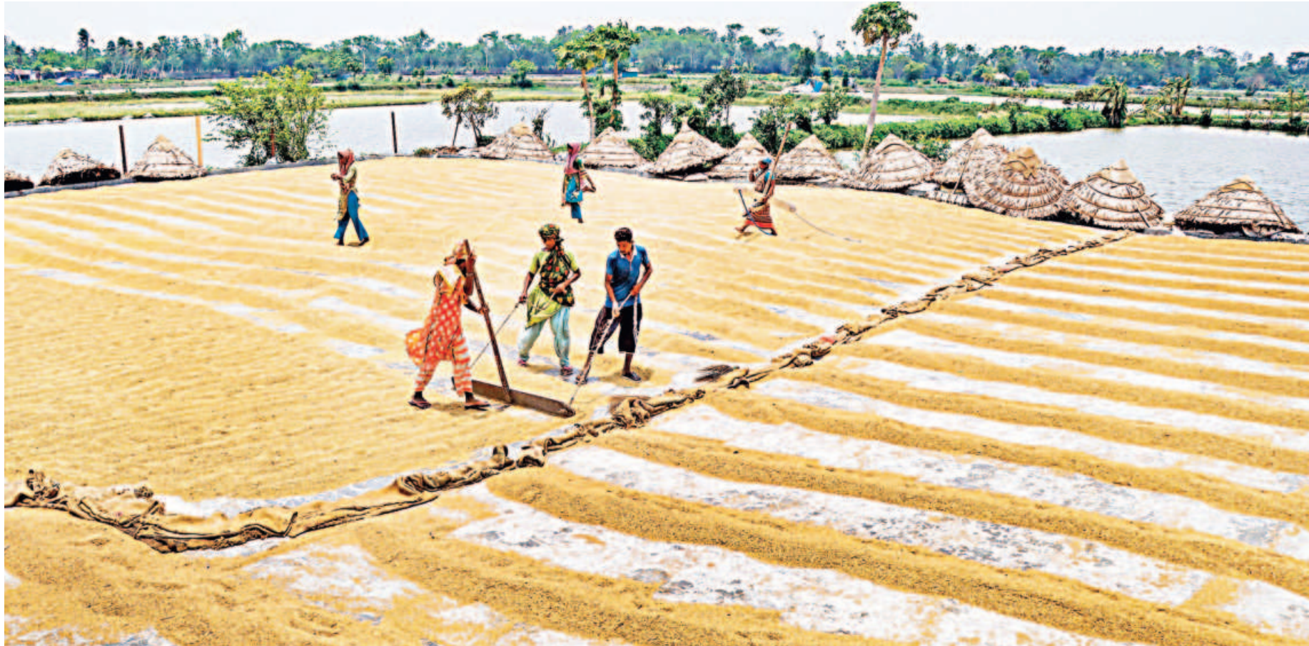
Agriculture labourers sun drying Boro rice, after collecting them from local farmers at a price of Tk 1,100-1,200 per maund. After purchase, they boil, dry and thresh the rice before selling them to wholesalers at Tk 40-50 per kg. The photo was taken in Ghona village of Khulna's Dumuria upazila recently.

Lacklustre England must make their presence felt P11