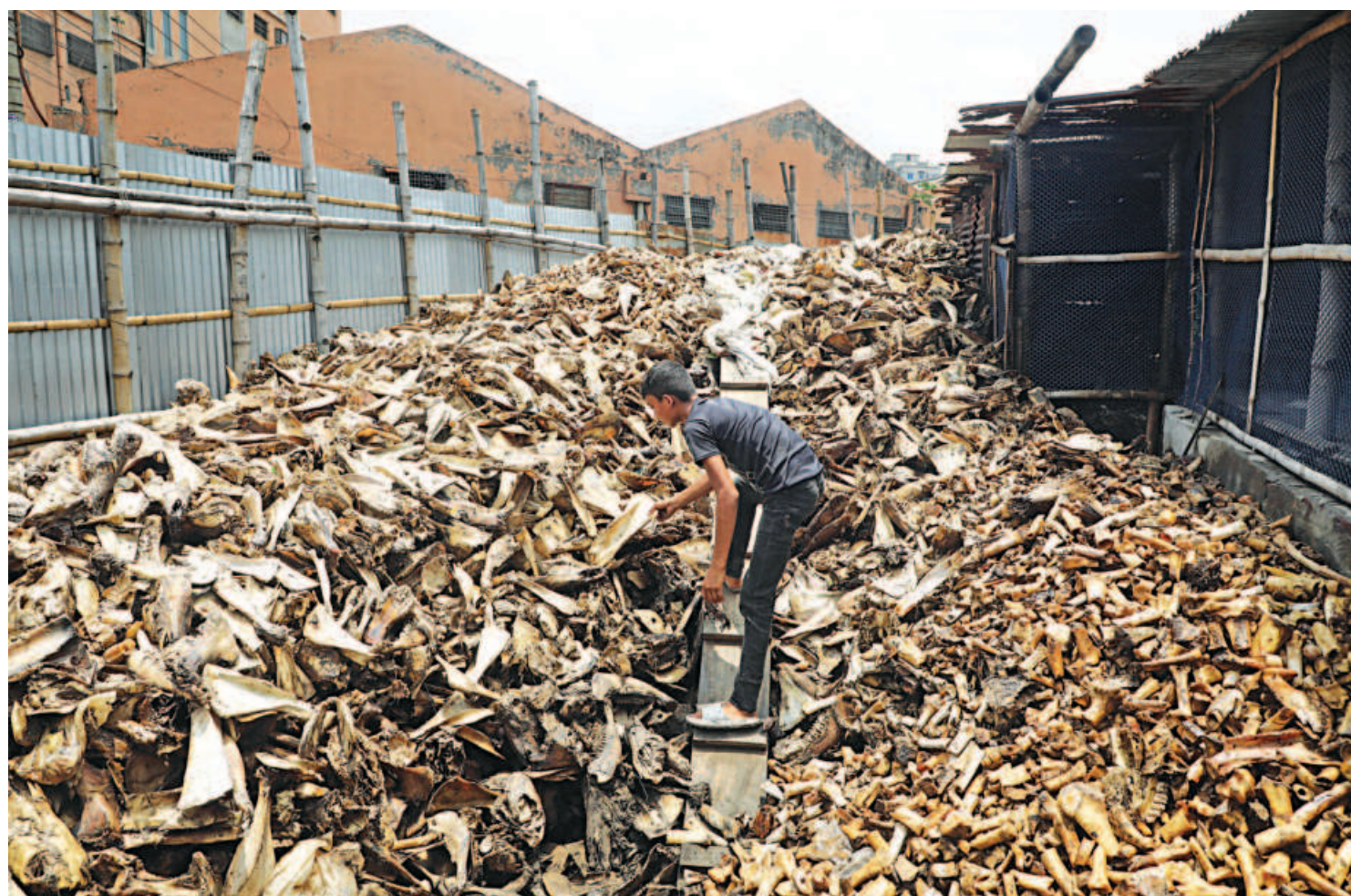
Bones and horns of sacrificial animals are brought in by street children, butchers, cleaners and hawkers from different parts of the country to a factory in Dhaka's Hazaribagh. After being cleaned and processed, these would later be sold by different shops in the area. Bones and horns of cattle are used as raw material to make different products, such as medicine capsule covers and ceramics. The photo was taken yesterday.