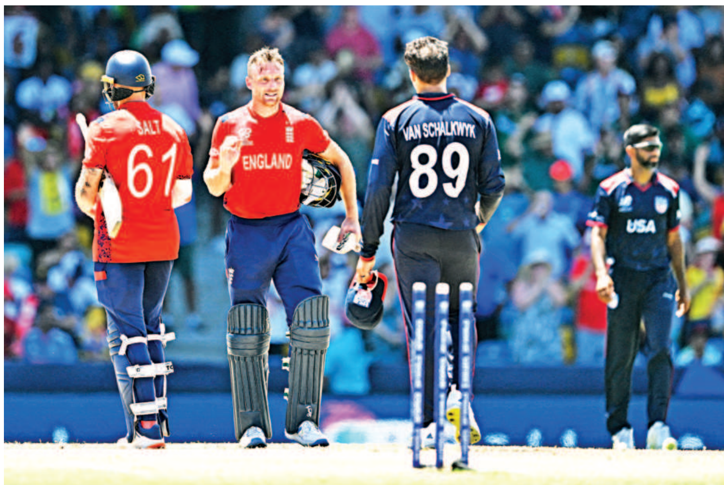
England's Jos Buttler and Phil Salt celebrate their 10-wicket victory against USA in a Super 8 fixture of the Twenty20 World Cup at Kensington Oval in Bridgetown, Barbados yesterday. Chris Jordan's hatrick helped dismiss USA for 115 before Buttler's unbeaten 83 and Salt's unbeaten 25 helped them chase down the target in 9.4 overs to book a place in the semifinals.