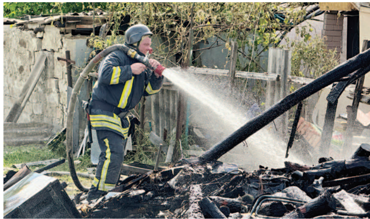
A firefighter works at a site of a Russian air strike, amid Russia's attack on Ukraine, in Kharkiv, Ukraine yesterday.