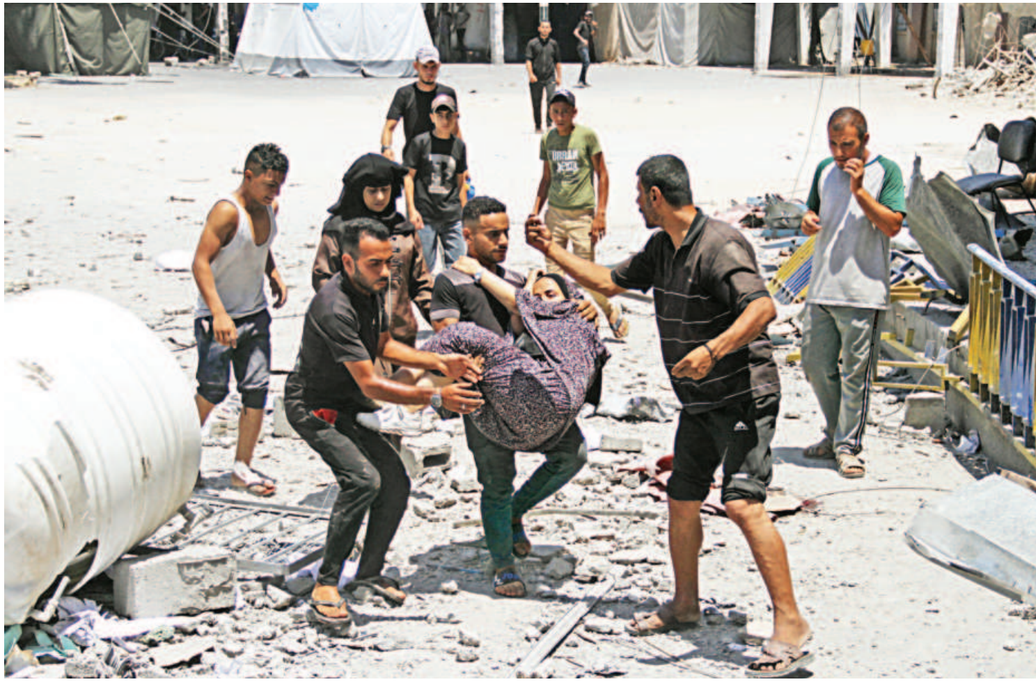
Palestinians carry a casualty outside the headquarters of UNRWA (United Nations Relief and Works Agency) following an Israeli strike in Gaza City yesterday. Israel's offensive since October 7 has left Gaza in ruins, killed almost 37,600 people, according to Palestinian health authorities, and left nearly the entire population homeless and destitute.