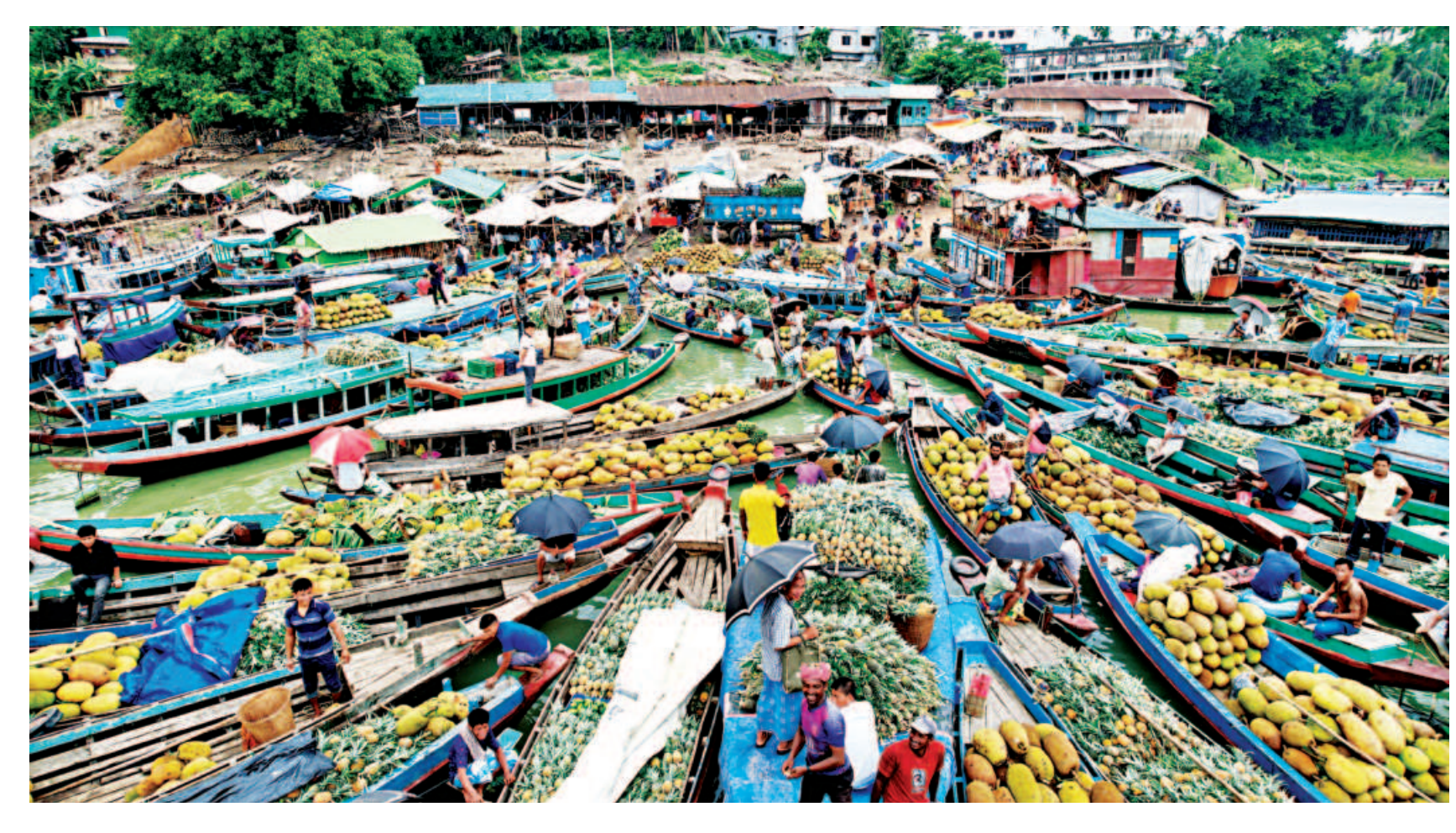
Boats carrying summer fruits, mostly jackfruits and pineapples, gathered at Rangamati's Banarupa Bazaar, one of the largest floating markets in the country. Fruits and other products from at least 10 upazilas are brought in on boats and trawlers to be sold at this market every Wednesday. The photo was taken from the district's Samata Ghat area.