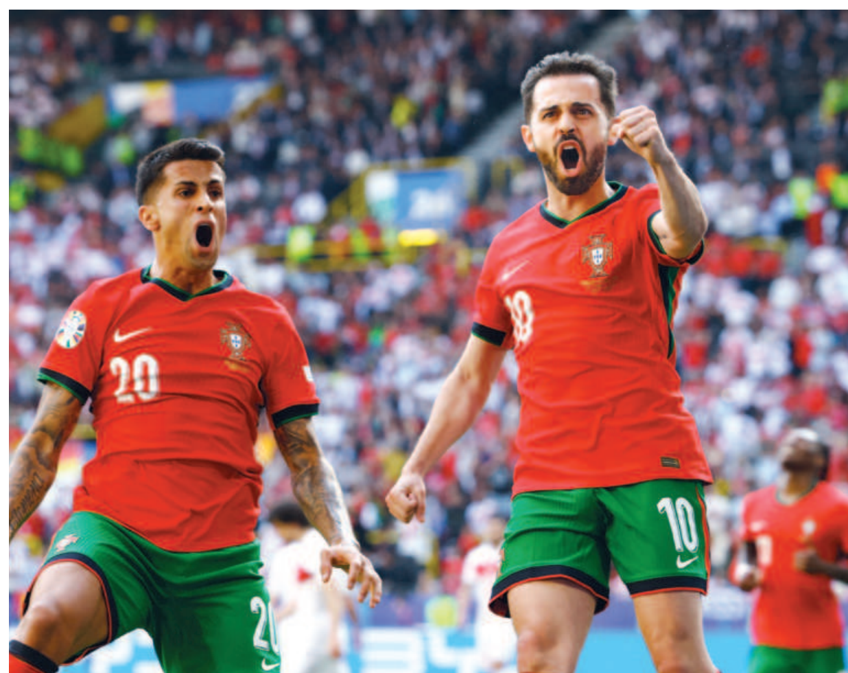
Portugal's Bernardo Silva celebrates scoring their first goal with Joao Cancelo during their 3-0 win against Turkey in a Group F fixture of Euro 2024 at the BVB Stadion in Dortmund yesterday. The result ensured the 2016 champions enter the last 16.

"It is therefore possible that Julian Nagelsmann first starts with this attempt and doesn't win the title right away, but instead builds up something to win in 2026."