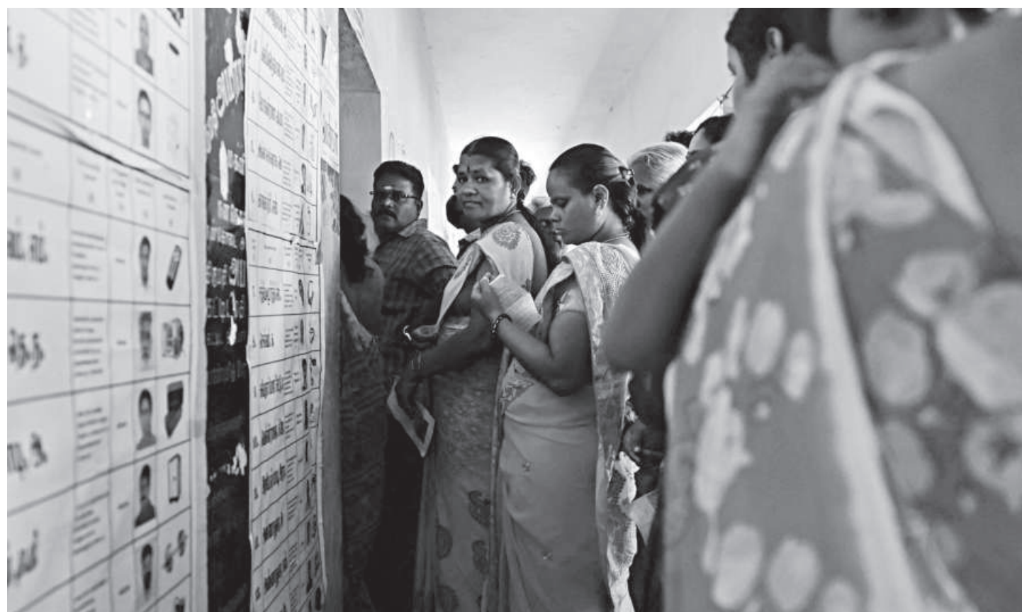
Voters line up outside a polling station in Tamil Nadu, India, on April 19, 2024.

However, in the recently concluded 18th Lok Sabha election, Indian voters did not make the same mistake. About 66 crore voted to demote Modi from the status of a self-proclaimed "god-sent avatar" to just a mortal human being. BJP could only secure 240 seats in the 2024 elections, falling short of the 272 seats needed to solely form the government. It had to seek support from its partners in the NDA, particularly from the Janata Dal (United)—headed by veteran politician and nine-time chief minister of Bihar, Nitish Kumar—with 12 seats, and the Telugu Desam Party (TDP)—led by yet another seasoned politician from Andhra