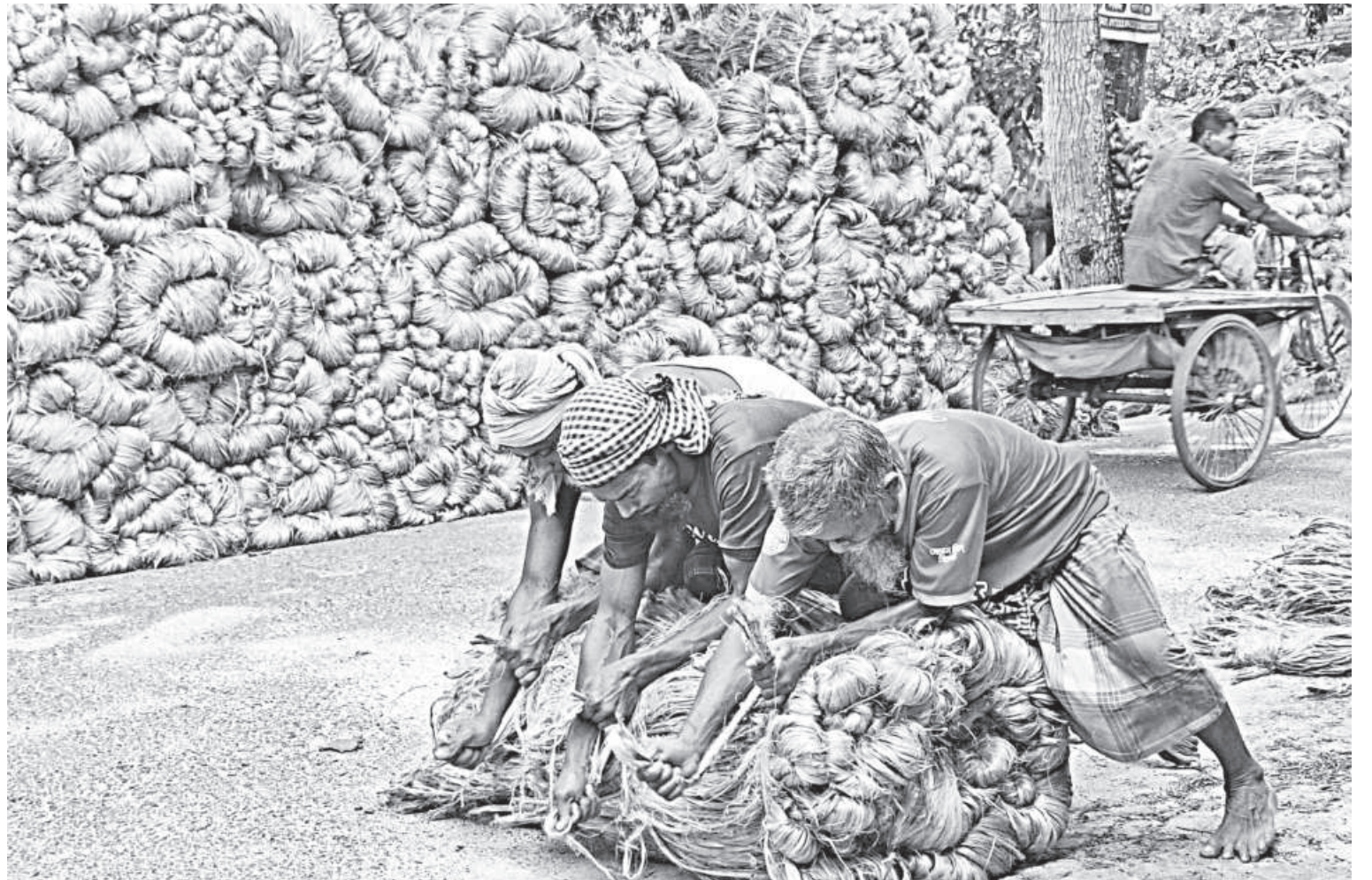
At the break of dawn, these workers start the process of rolling jutes manually. After a day's hard work, the labourers make Tk 700. The photo was taken in Barishal's Babuganj yesterday.