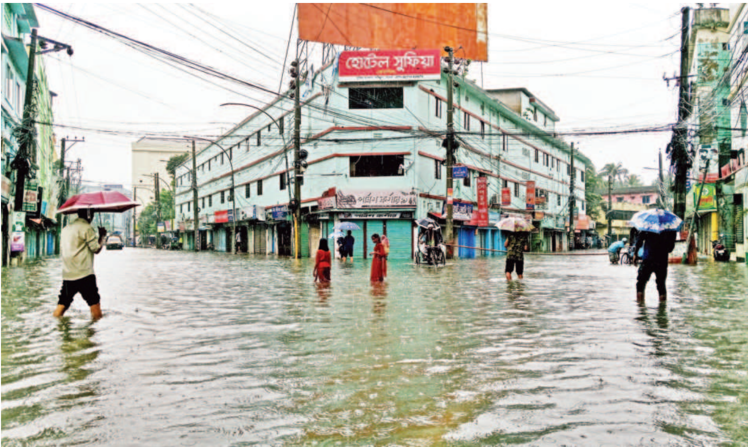
Heavy rains and onrush of water from upstream have flooded most of the areas of Sylhet city. This intersection in the city's Taltala area has gone under water, affecting people and businesses alike. The photo was taken yesterday afternoon.