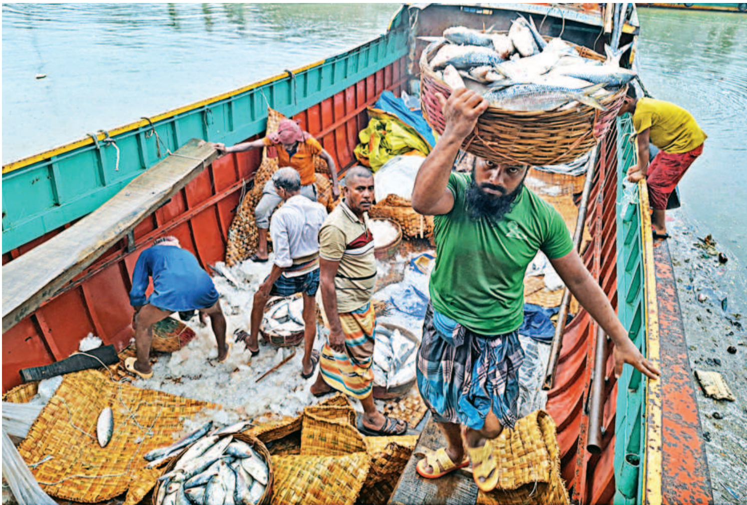
Workers unloading hilsa from a boat at the wholesale fish market in Barishal city's Port Road area yesterday morning. The fish, caught from the Meghna river, was sold for Tk 20,000 to Tk 40,000 per maund, depending on size and quality.