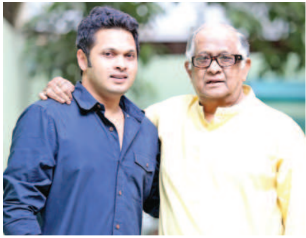
Samrat with his father, Nayak Raj Razzak.