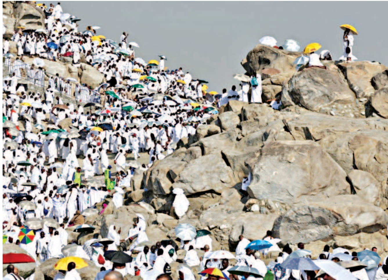
Pilgrims pray at dawn on Saudi Arabia's Mount Arafat during the climax of the Hajj pilgrimage yesterday. Over 1.5 million Muslims prayed there in soaring temperatures.