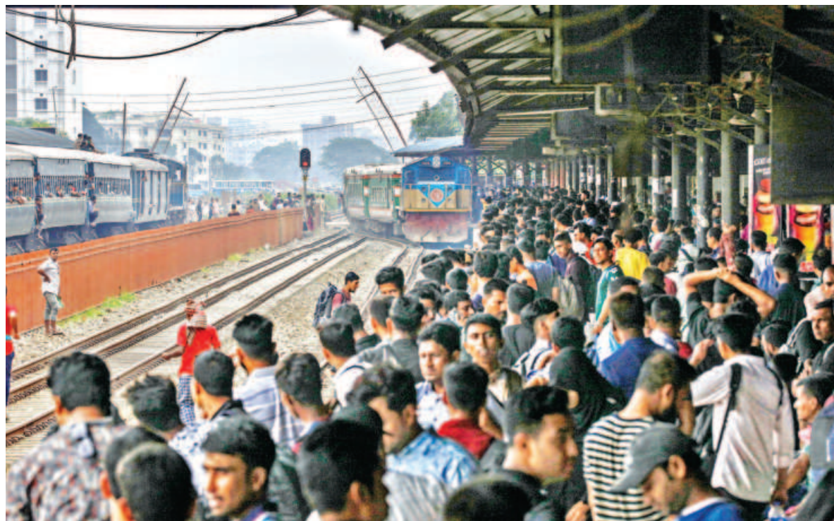
Aching to go home to celebrate Eid-ul-Azha with friends and family, several hundred people were waiting for a train at Dhaka Airport Railway Station yesterday morning.