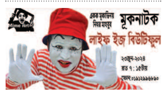
Solo Mime of Life is Beautiful

June 23 | 7:15pm Studio Theatre, Bangladesh Shilpakala Academy