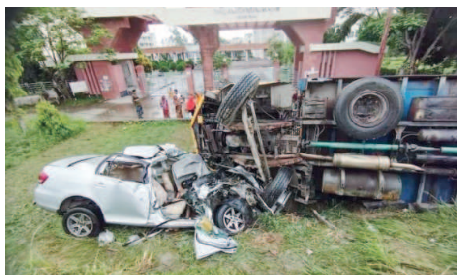
At least three people, including a child, were killed and two injured in a head-on collision between a private car and a cattle-laden truck in Kalihati upazila of Tangail yesterday.

"Necessary action will be taken against the culprits by identifying them, and the encroached river bank areas will be recovered," he added.