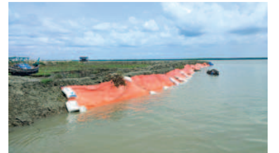
Several fish enclosures have been set up using makeshift fences, bamboo and polythene sheets to prevent flow of water. Some pasture lands on the river bank were also dug to make more enclosures.

Khulna Wasa and KDA did not finish their repair work on time. The service-providing agencies must consider the sufferings of city dwellers before taking up development projects, he added.