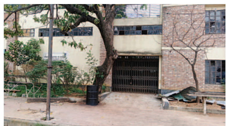
The slaughterhouse in Mohakhali remains unused while the one at Kaptan Bazar (right) lies incomplete. Meanwhile, Hazaribagh slaughterhouse is still unopened.