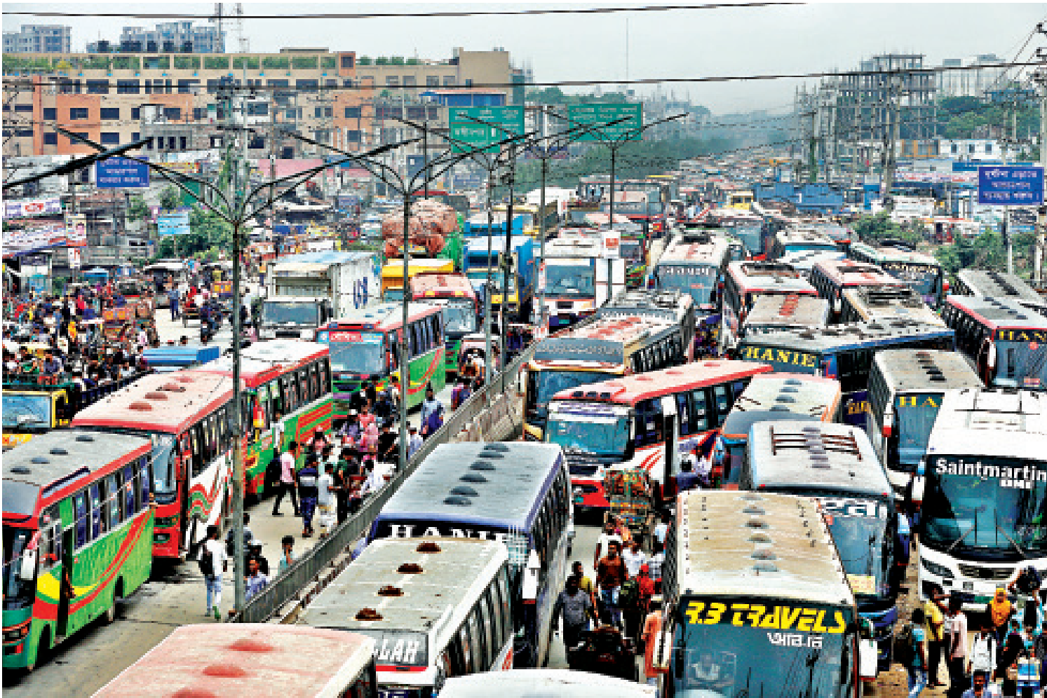
EID RUSH BEGINS ... Due to the pressure of holidaymakers, the Dhaka-Tangail highway saw tailbacks of several kilometers till at least 7:00pm. People in and around the capital have begun their Eid journeys yesterday, ahead of the weekend, as the festival will be celebrated on June 17. The photo was taken from Ashulia's Baipail area around 2:30pm.