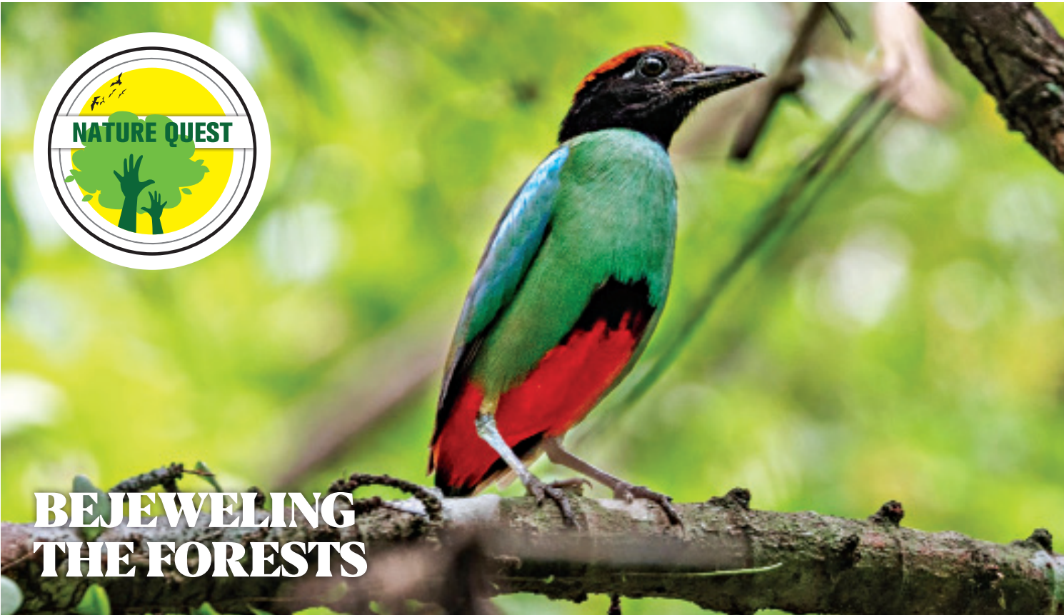
A western hooded pitta spotted in the Hazarikhil Wildlife Sanctuary in Chattogram. It's one of Asia's most frequently observed and familiar pitta's and it's no surprise that its range spans from eastern to southeastern Asia and maritime southeast Asia, where it lives in different kinds of forests, plantations and other cultivated areas. As lowland species, it's easily identified throughout its range due to the striking colours: emerald green body plumage, dark head, bright blue wings and a dash of red in the underbelly. Though it is abundant in its range, a slow decline in its population shows that within a decade or so, it might become a vulnerable species. Spotted from April to August during its breeding season, this bird highlights the sanctuary's dense forest and undergrowth as a vital habitat, underscoring the importance of preserving such natural environments and celebrating the region's rich biodiversity.

Palestinians in the Gaza Strip were not able to travel to Saudi Arabia for hajj this year because of the Israeli offensive in the enclave that began eight months ago.