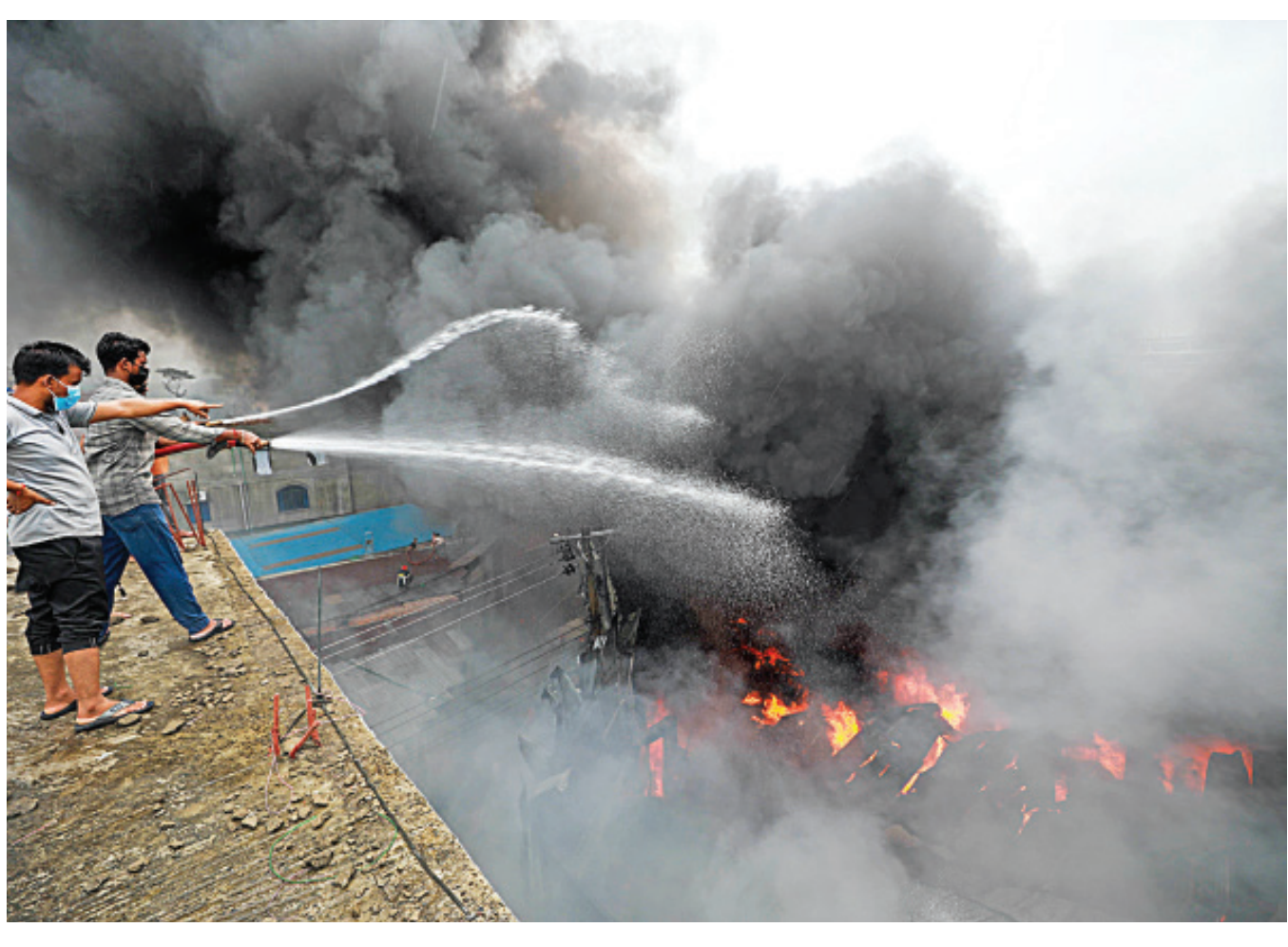
Workers trying to douse the fire that ravaged through Gartex Garments Ltd warehouse, in the City Gate area in Chattogram, yesterday morning. Six firefighting engines later brought the blaze under control around 1:00pm.

with migrant workers. The building, whose exterior was blackened with soot, housed 196 workers, according to information given to the interior minister by their employer.