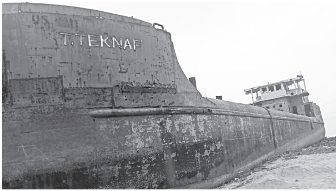
A recent photo shows the oil tanker at the shipyard. The vessel, however, has been "missing" since May 18.