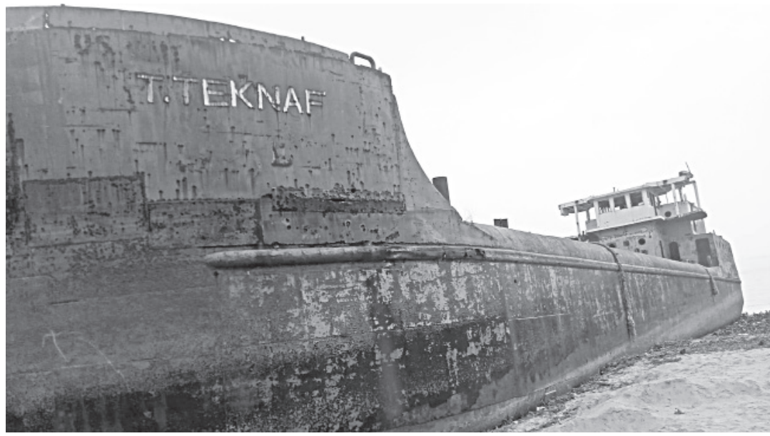
A recent photo shows the oil tanker at the shipyard. The vessel, however, has been "missing" since May 18.