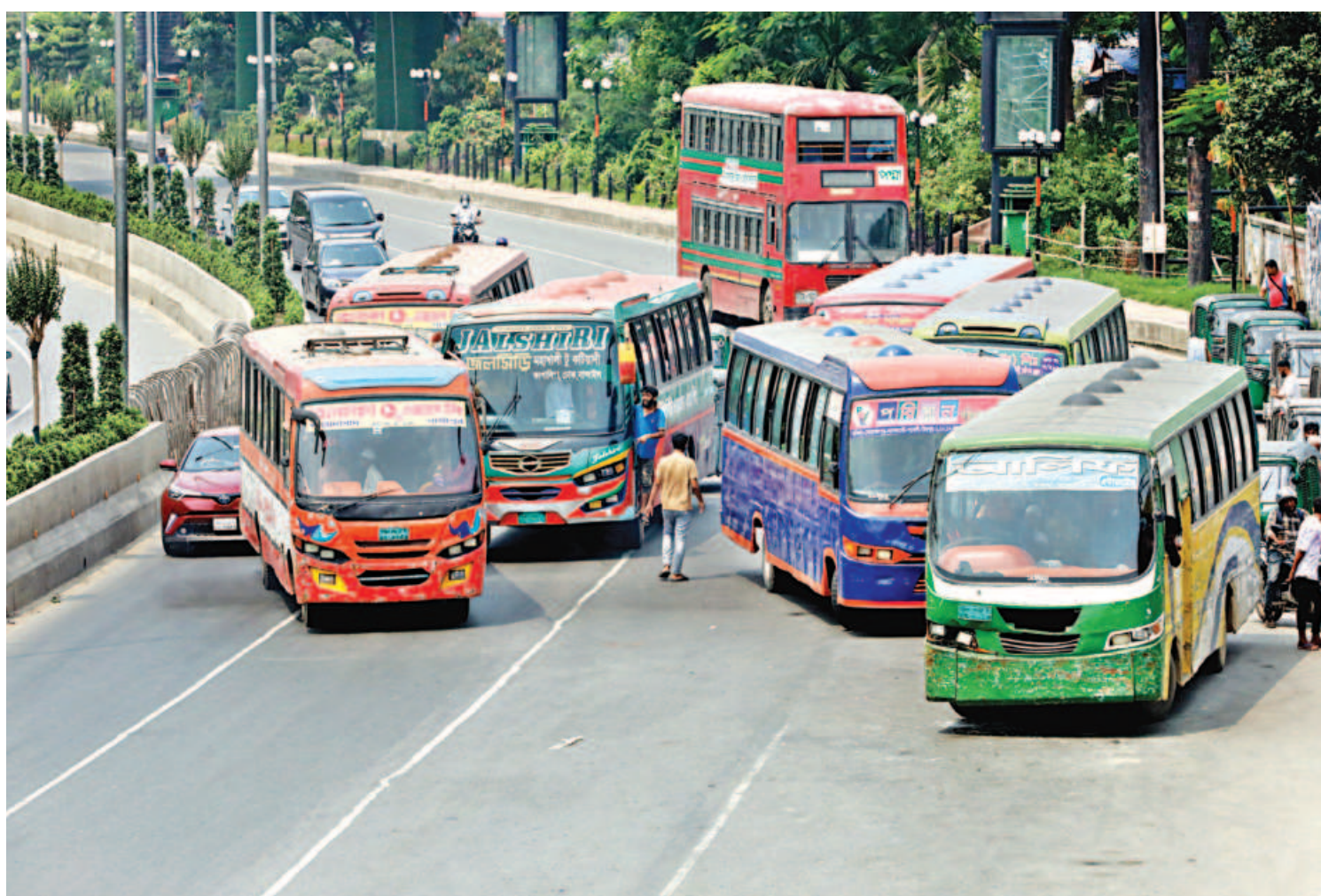
Buses pick up and drop off passengers obstructing traffic on the Airport Road in the capital's Kuril area. This not only puts bus passengers at risk but also causes tailbacks. The photo was taken around 1:00pm yesterday.