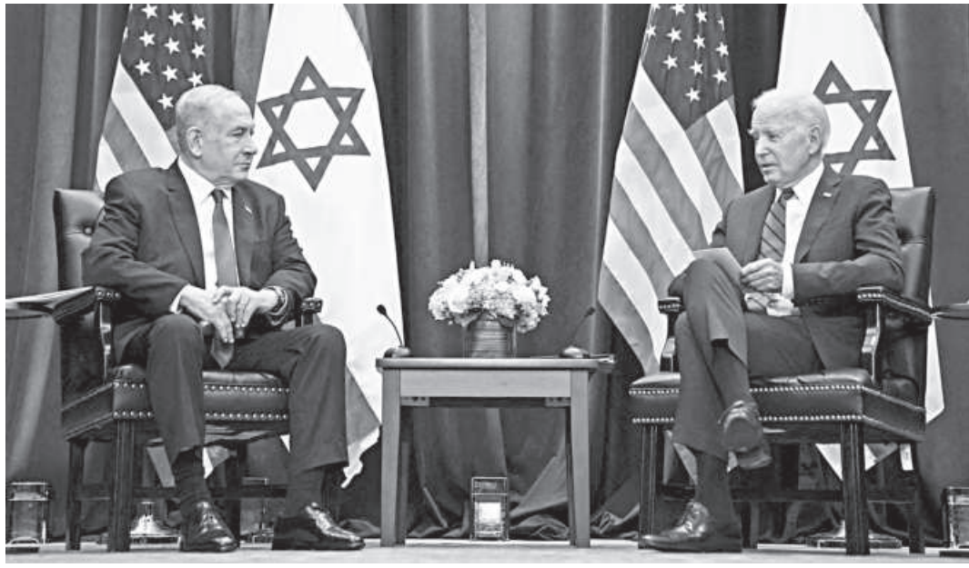
US President Joe Biden and Israeli Prime Minister Benjamin during a meeting in New York City, US on September 20, 2023.