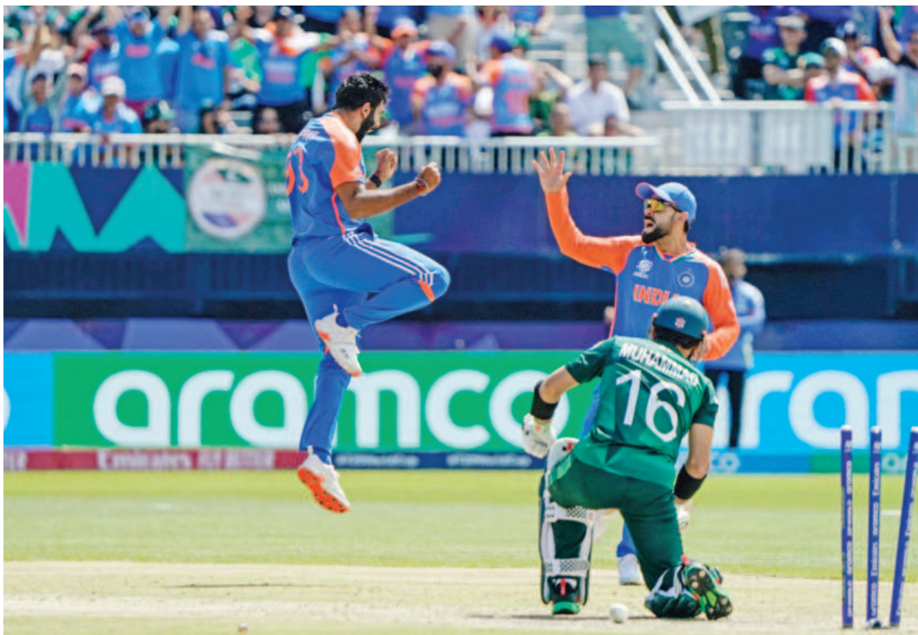
India's Jasprit Bumrah celebrates dismissing Pakistan opener Mohammad Rizwan during their Group A fixture of the ongoing T20 World Cup at the Nassau County International Cricket Stadium in New York today. Bumrah was the star as he claimed three wickets and helped India make a sensational comeback to beat Pakistan by six runs while defending a 120-run target.