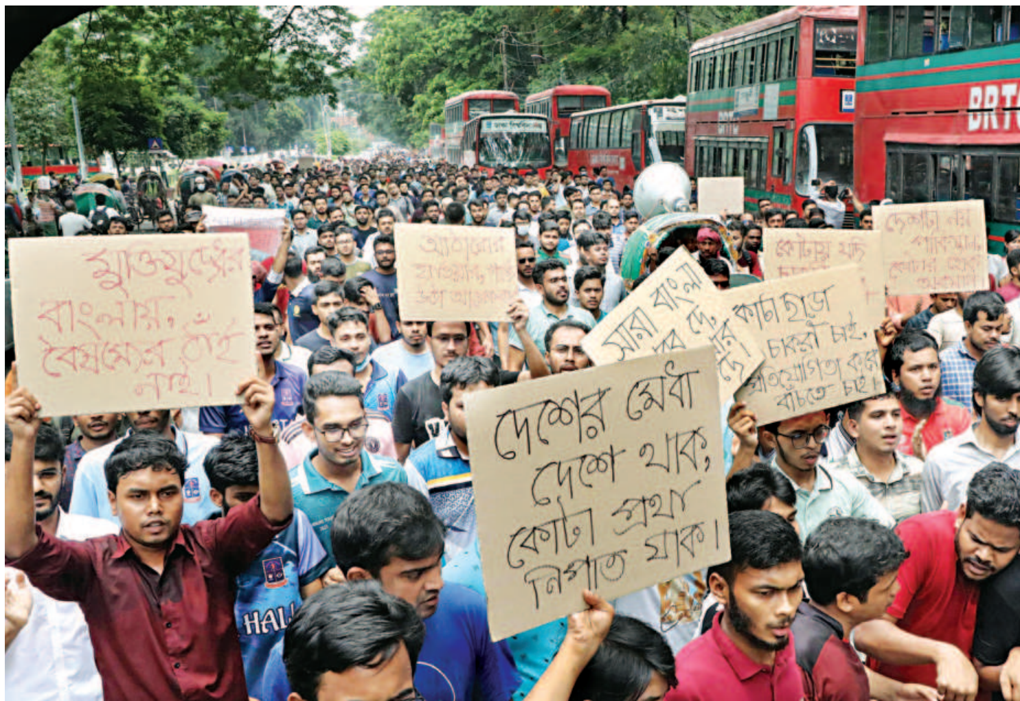
Several hundred students of Dhaka University yesterday staged a protest on the campus, demanding the cancellation of the 30 percent quota for the freedom fighters' children in the first and second tier government jobs.

Killings along the Bangladesh-India border have risen over the last three years despite repeated state-level commitments to bring such killings down to zero.