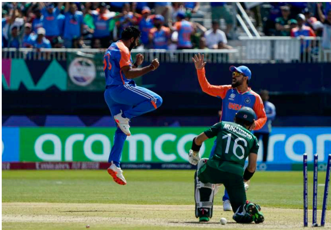
India's Jasprit Bumrah celebrates dismissing Pakistan opener Mohammad Rizwan during their Group A fixture of the ongoing T20 World Cup at the Nassau County International Cricket Stadium in New York today. Bumrah was the star as he claimed three wickets and helped India make a sensational comeback to beat Pakistan by six runs while defending a 120-run target.