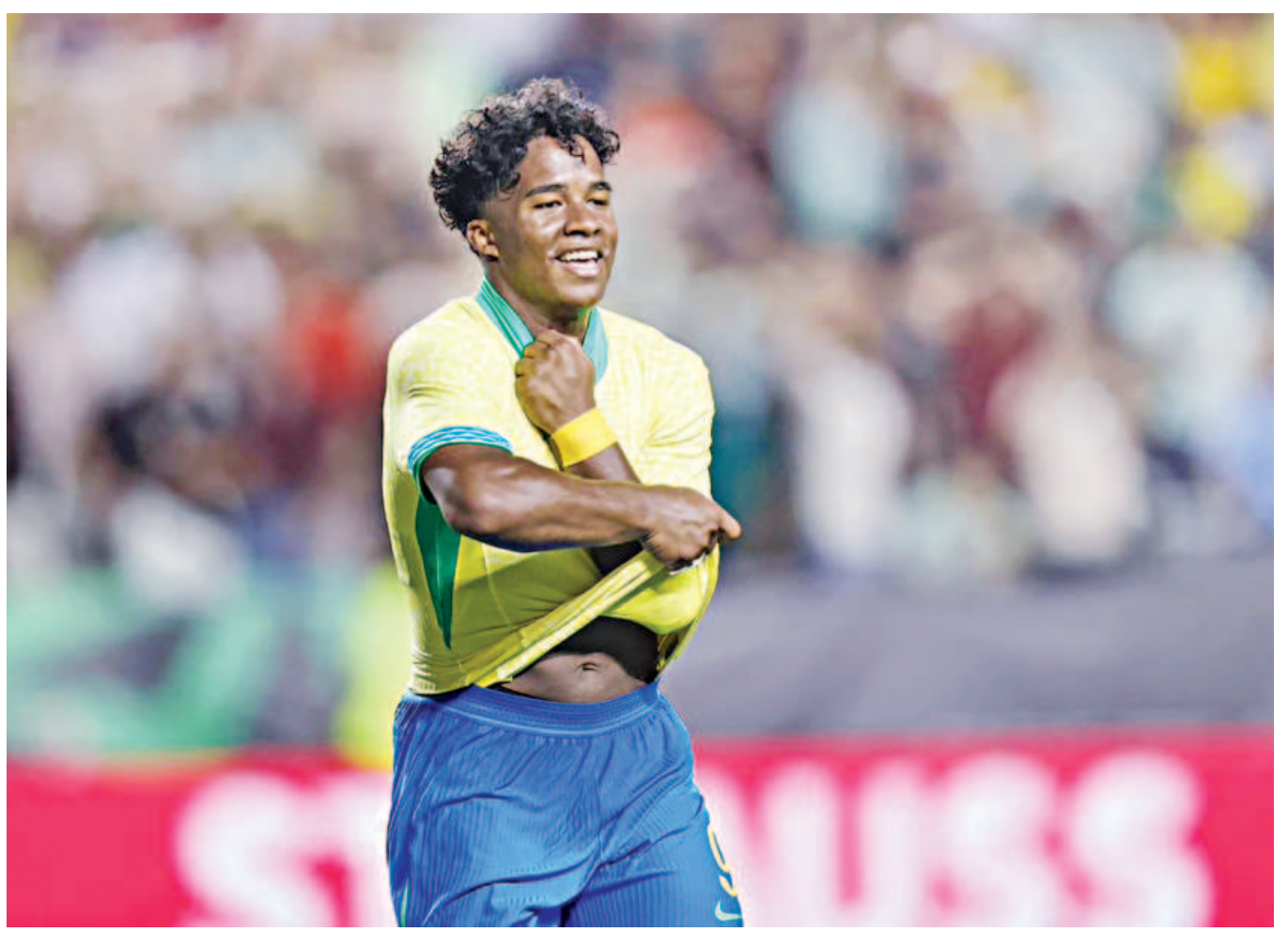
Brazilian wunderkind Endrick and Vinicius Junior combined to help Brazil seal a 3-2 win over Mexico in their pre-Copa America friendly in Texas on Saturday. Endrick, who will be joining Vinicius at Real Madrid next season, headed in the winner in the 92nd minute from a Vinicius cross after Mexico had drawn level with the Selecao.