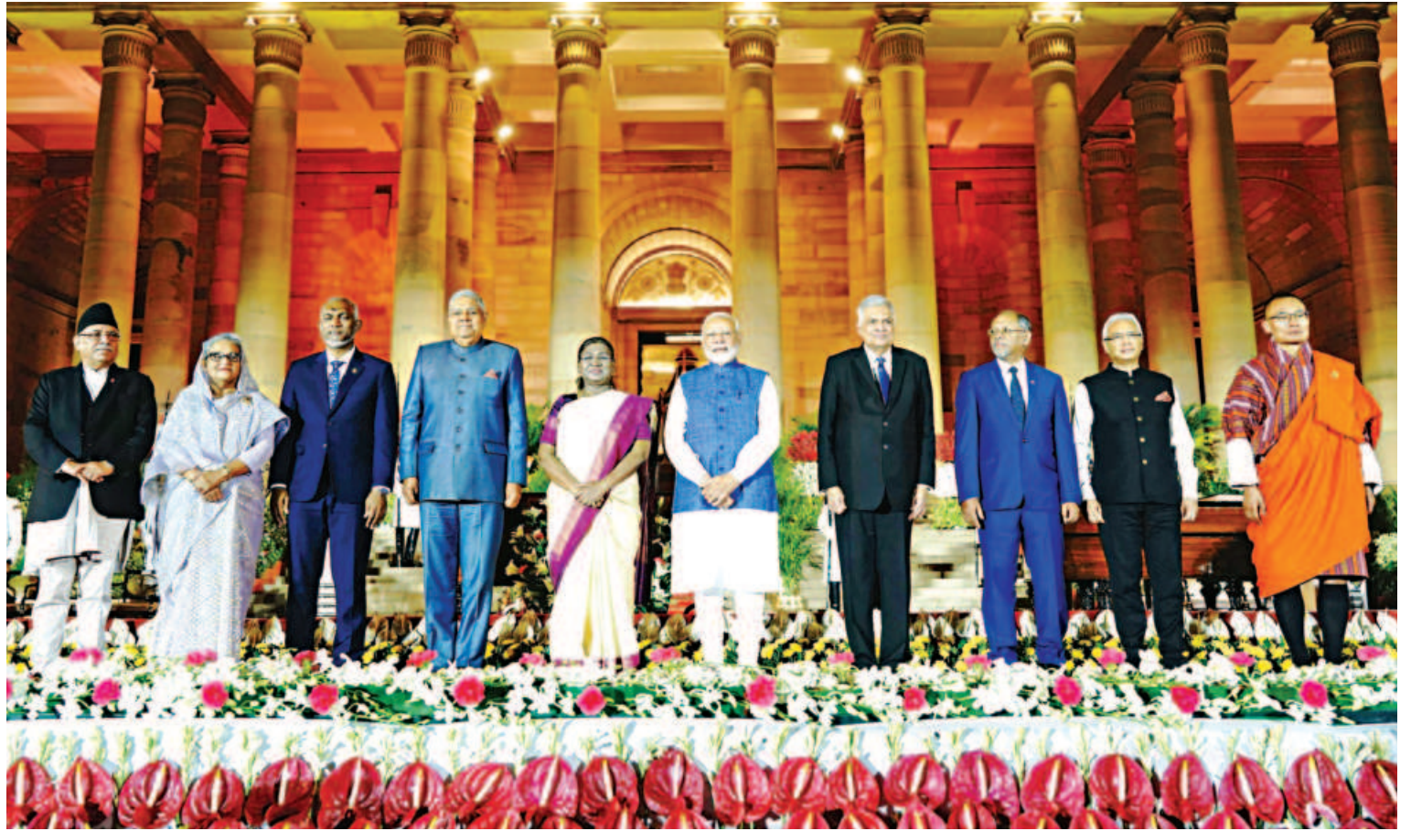
Prime Minister Sheikh Hasina, with heads of state and government, poses with Indian President Droupadi Murmu and Narendra Modi, who was sworn in as the prime minister of India for the third consecutive term yesterday.