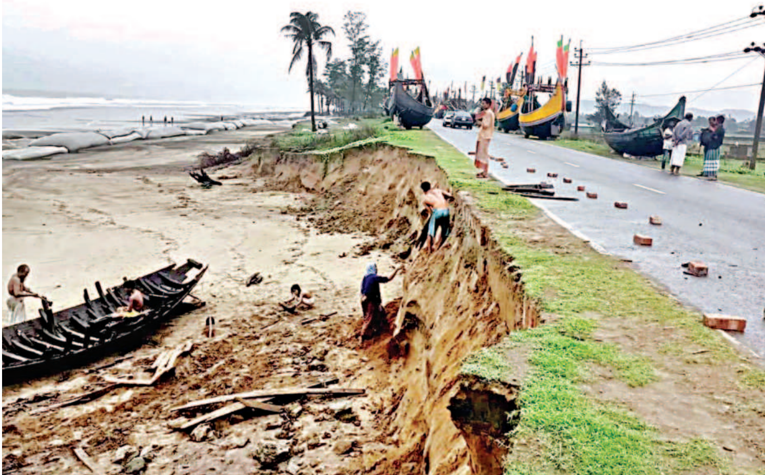
A big portion of the Marine Drive Road in Cox's Bazar's Teknaf upazila has washed away into the sea due to severe erosion in the Bay of Bengal. The erosion began on Friday evening in Mundardail area of the upazila's Sabrang union. The photo was taken yesterday.