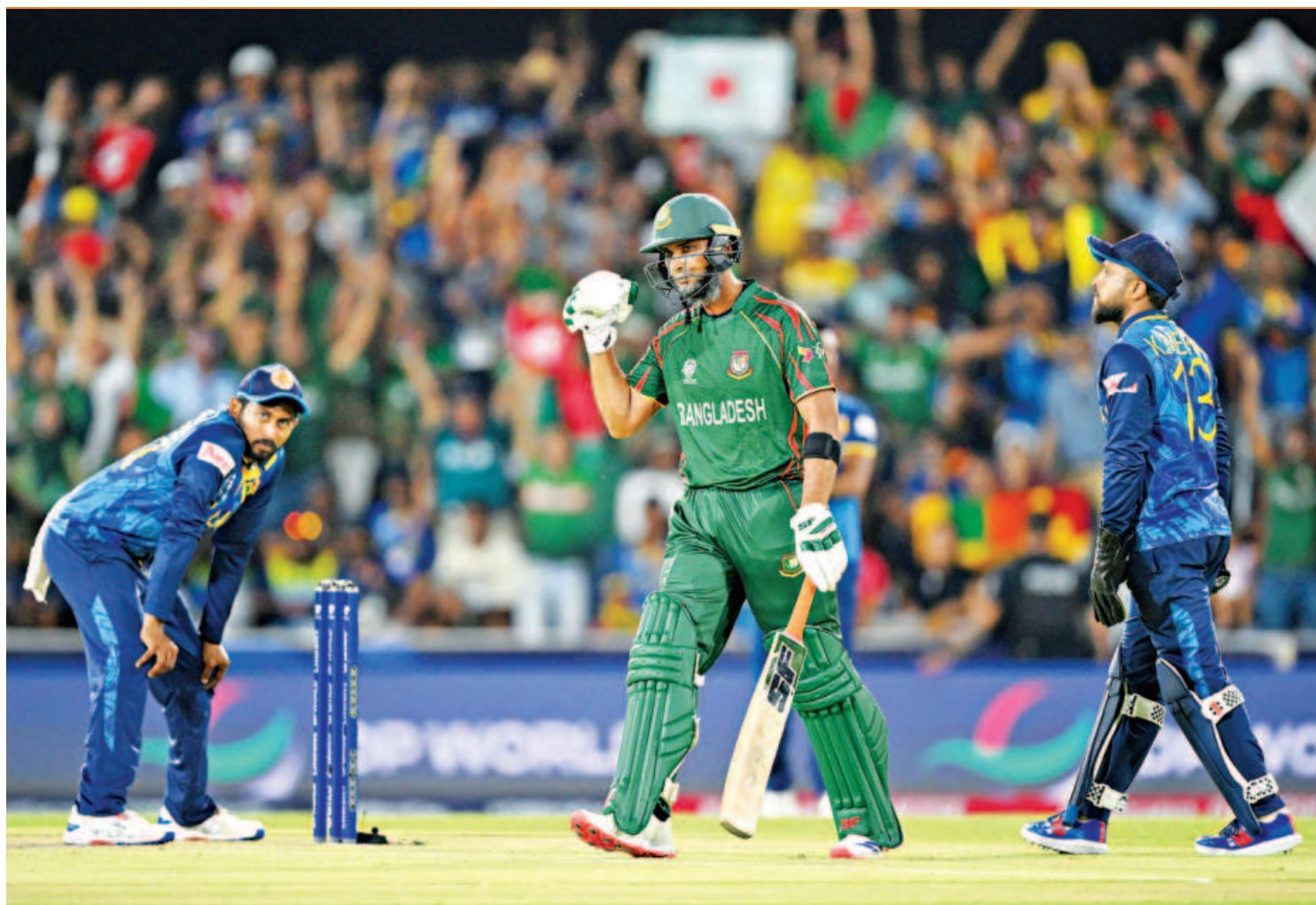
Mahmudullah Riyad clenches his fist after guiding Bangladesh to a thrilling two-wicket victory against Sri Lanka in their Twenty20 World Cup Group D match at the Grand Prairie Cricket Stadium in Texas yesterday.