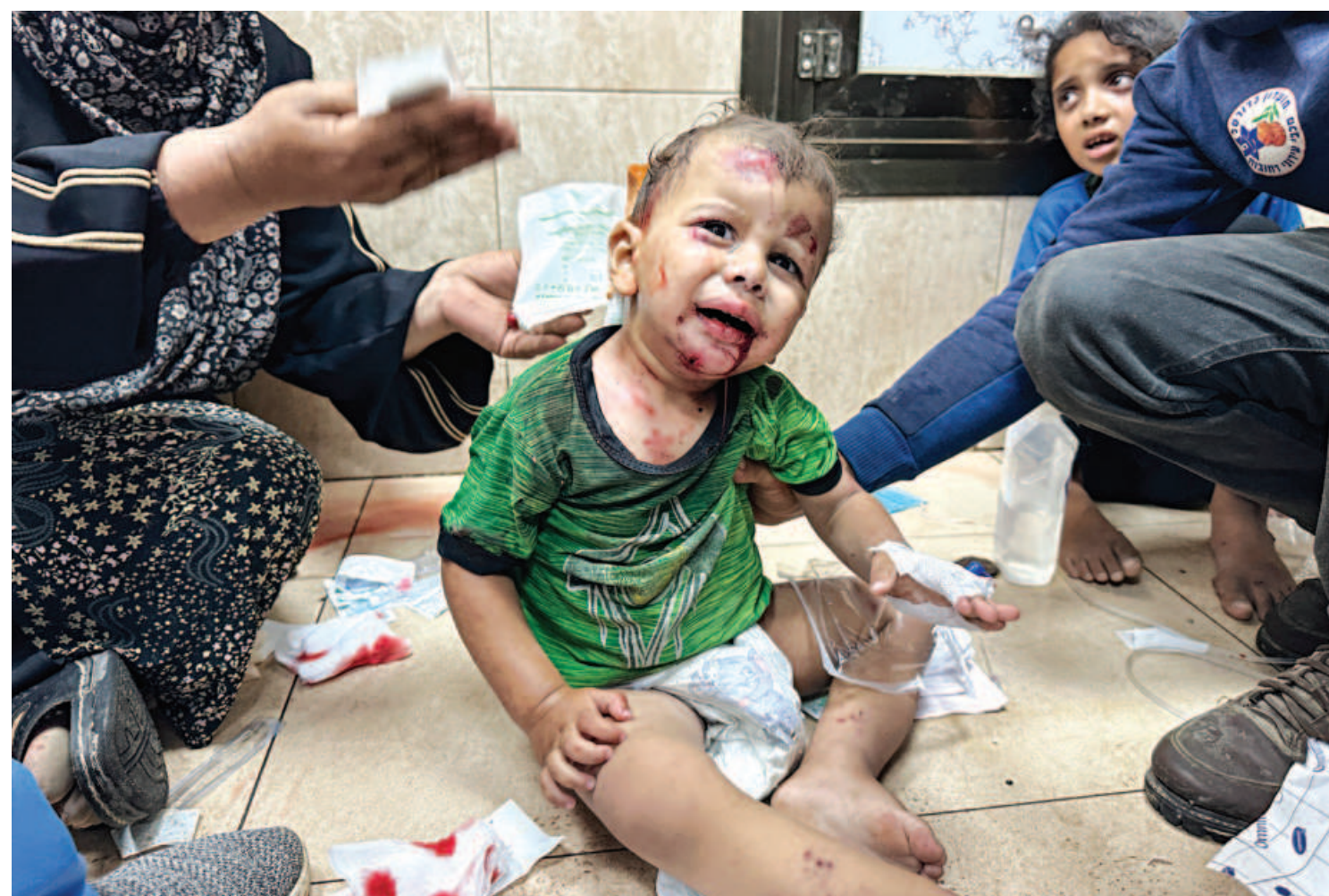
A child, injured in an Israeli strike, is being assisted at Al-Aqsa Martyrs Hospital in the central Gaza Strip yesterday.