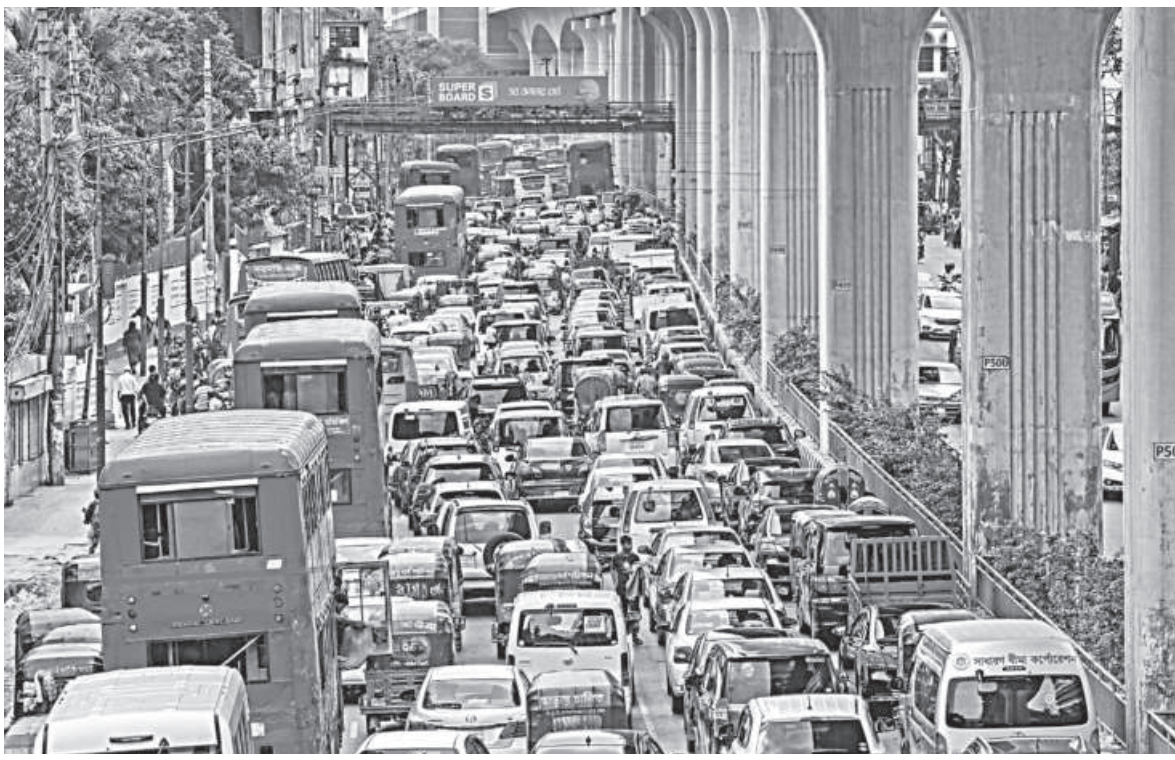
A long tailback on the capital's Kazi Nazrul Islam Avenue near Paribagh around 2:00pm yesterday. Heavy traffic, even in the afternoon, continues to be a problem that haunts the city.