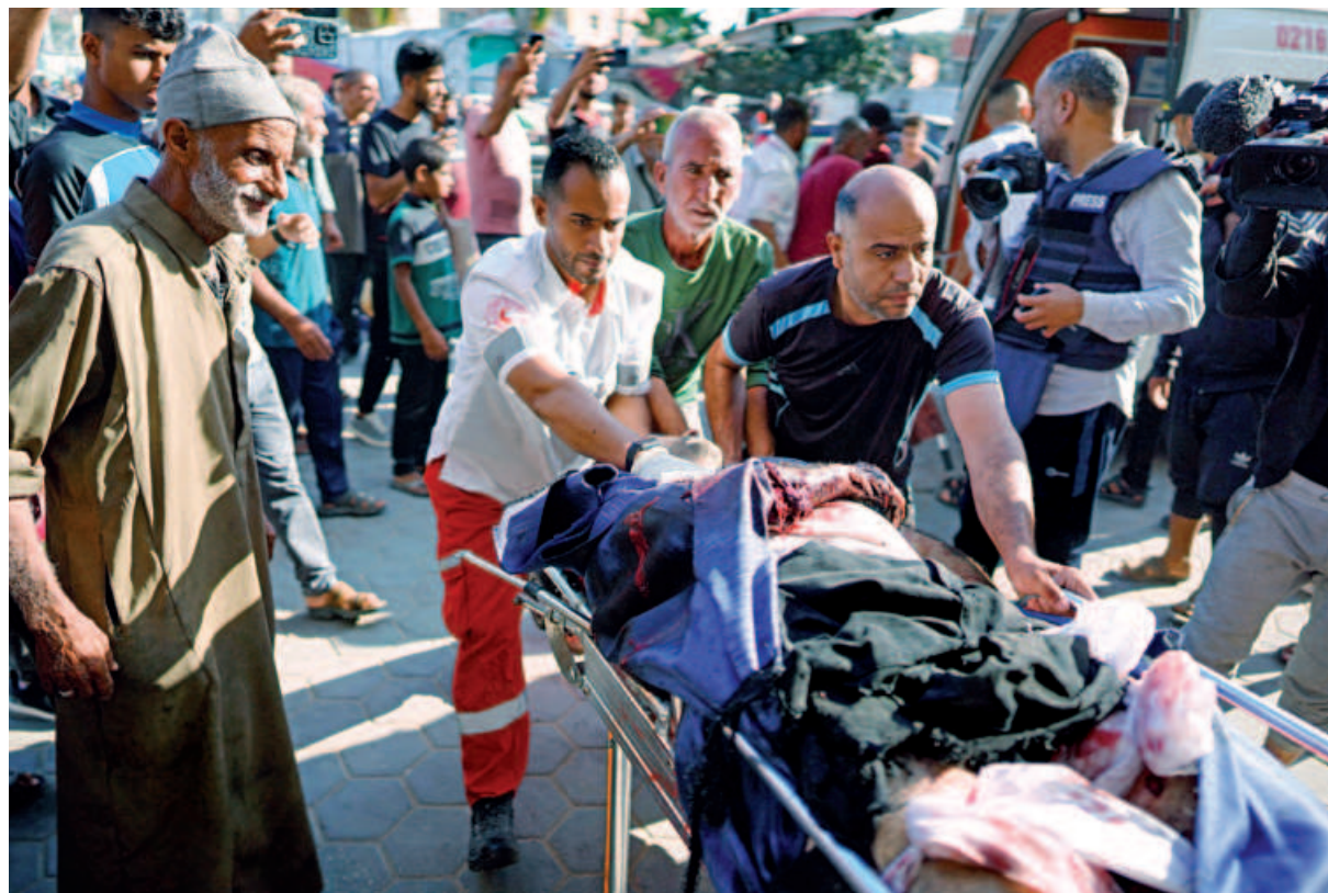
Palestinian medics rush a person to a hospital in Deir el-Balah in the central Gaza Strip following Israeli bombardment yesterday