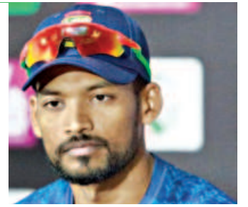
Bangladesh captain Najmul Hossain Shanto

"The audiences will have expectations, and they want us to play good cricket. We want to show Bangladesh people how well we can perform."