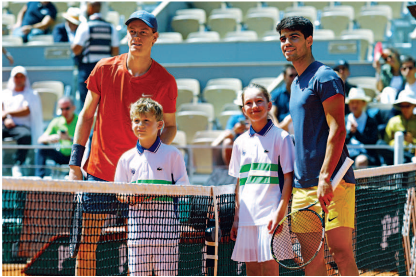
Jannik Sinner (L) and Carlos Alcaraz – two of the biggest stars of tennis' new generation -- pose for a picture prior to the first men's singles semifinal match of the French Open on Court Philippe-Chatrier at the Roland Garros on Friday.

"Different countries are being treated differently. We have called for an explanation from the organisers of the tournament."