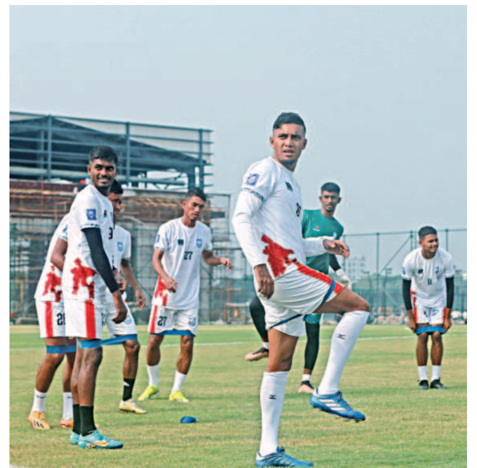
Bangladesh and Australia players sweated it out at the practice venue of the Bashundhara Kings Arena yesterday ahead of their World Cup Qualifier today. The Men in Red and Green had lost the reverse fixture 7-0 in Melbourne in November last year.

"Look, we have our standards and, when I say that, all our players understand that 'I don't care who we play against, whenever you wear the national team shirt of Australia on your heart, you play to the best of your ability with the right mindset to win the game,'" remarked the Australia coach when asked about the slim chances of losing against Bangladesh.