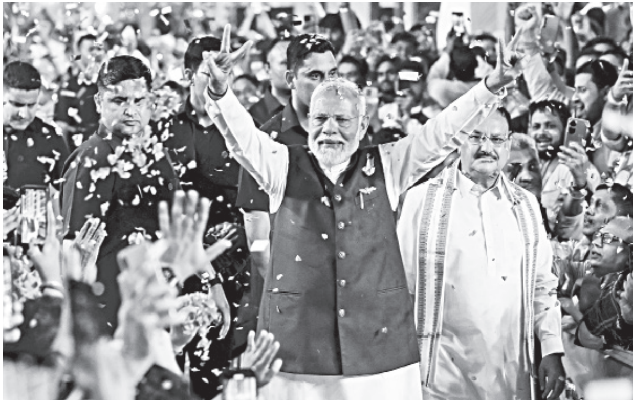
Unlike the past two Lok Sabha elections, where Narendra Modi's BJP won enough seats to form the government alone, the party has fallen short of a clear majority this time and is dependent on the coalition NDA.