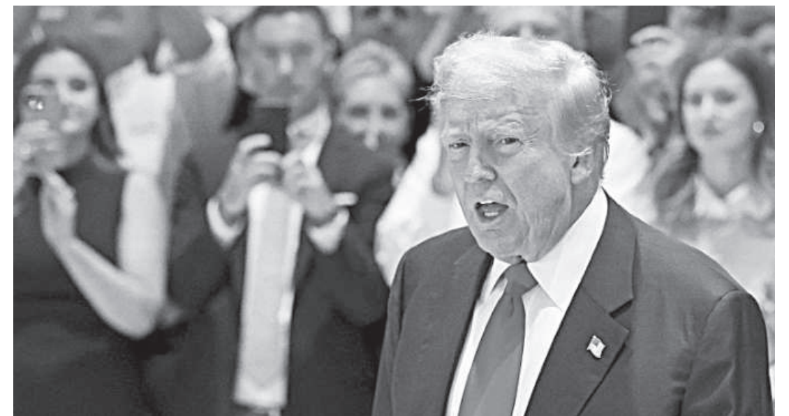
Could Donald Trump be the first felon elected to be US president?

The effect of Trump's conviction on his support is hard to gauge, given mixed response to recent polls. While he has lost some support, about half of the respondents say they are more likely to vote for him, Axios